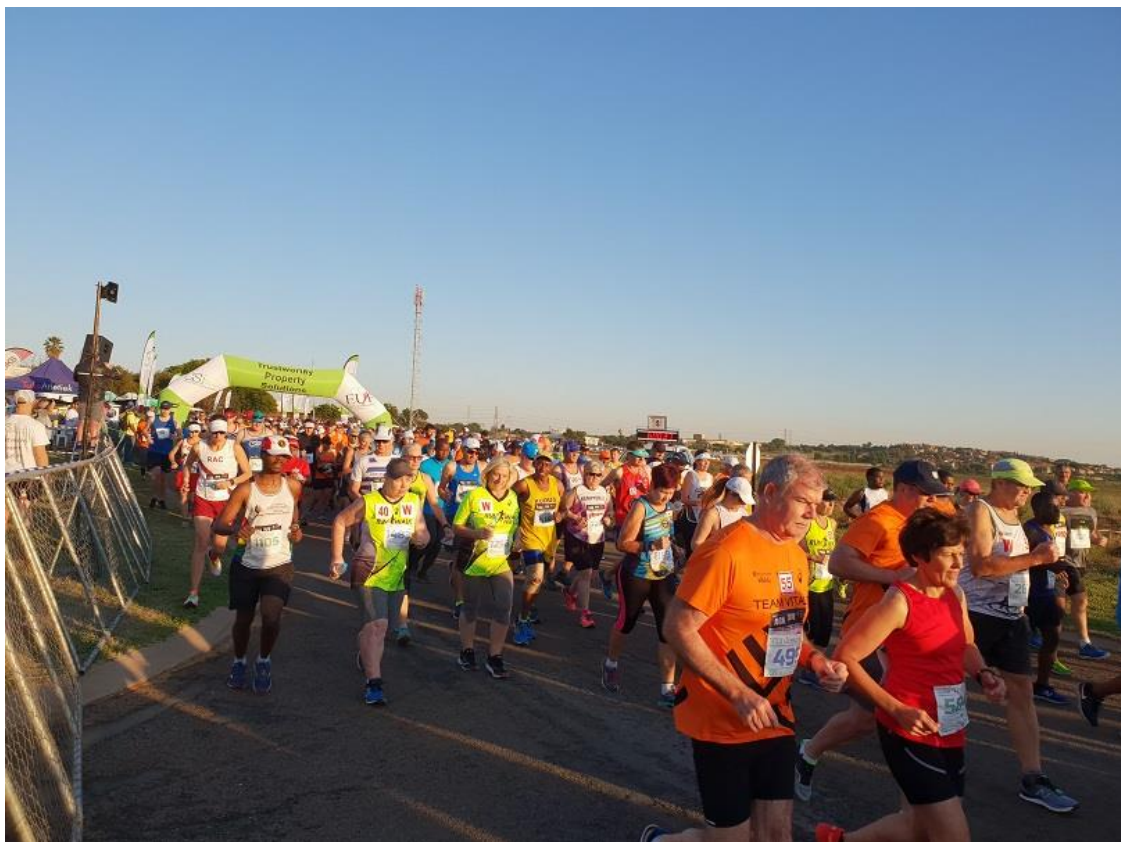
Away they go