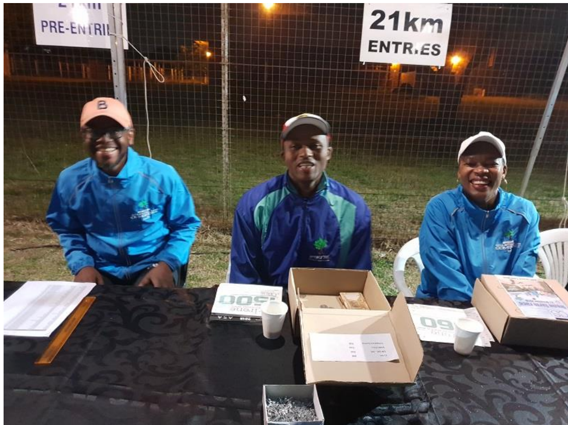
Friendly people at the entry tables make a huge impression