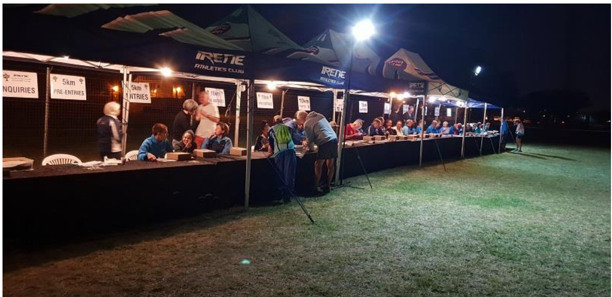
Ready for action at the entry tables