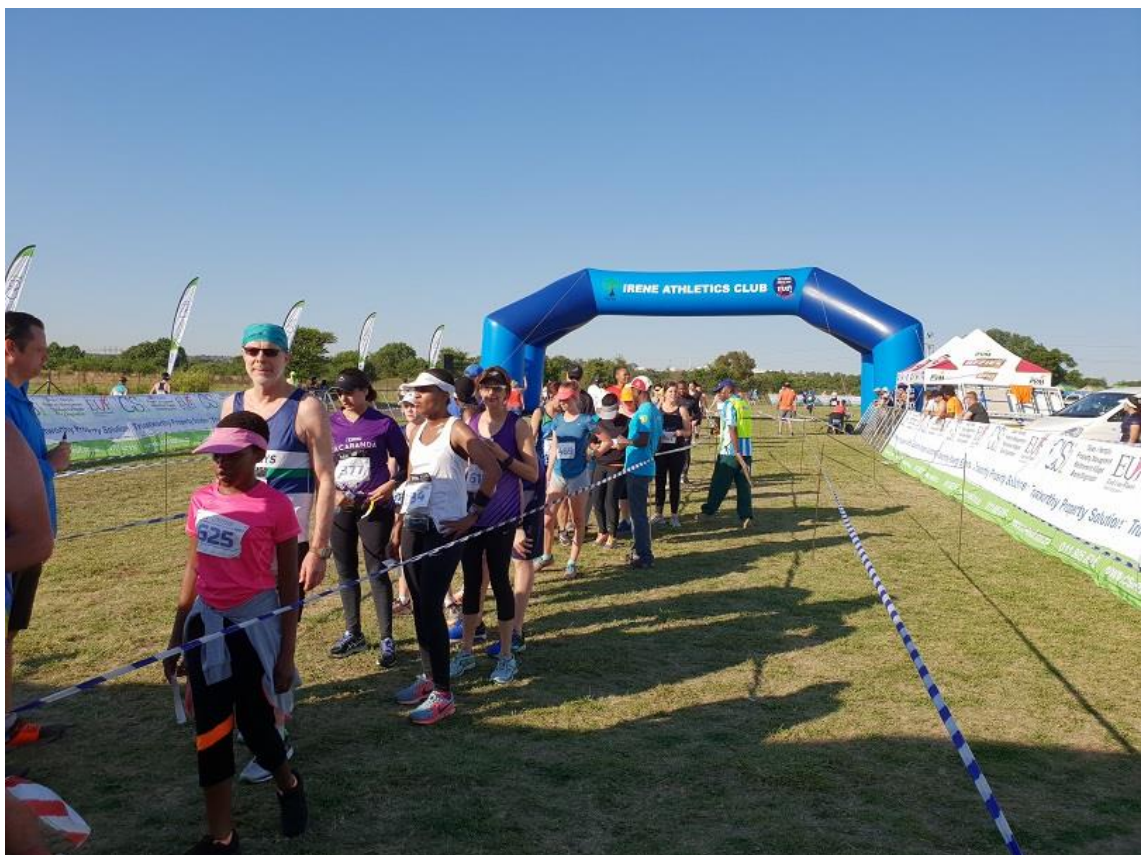
Our finish arch is one of a kind