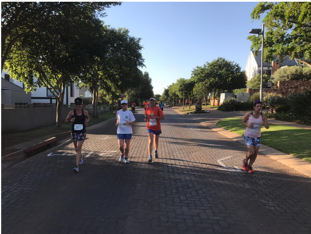
Helpers running in Southdowns