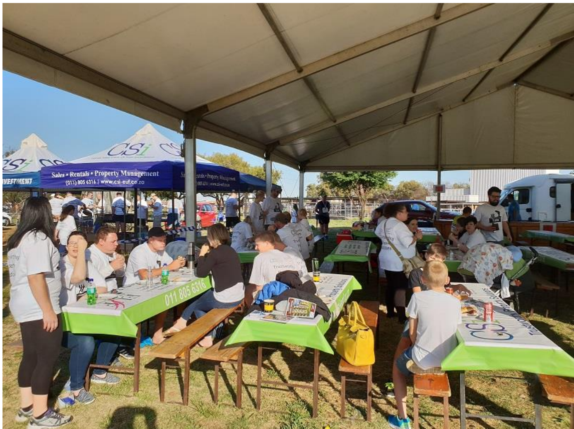
CSi personnel relaxing in the tent