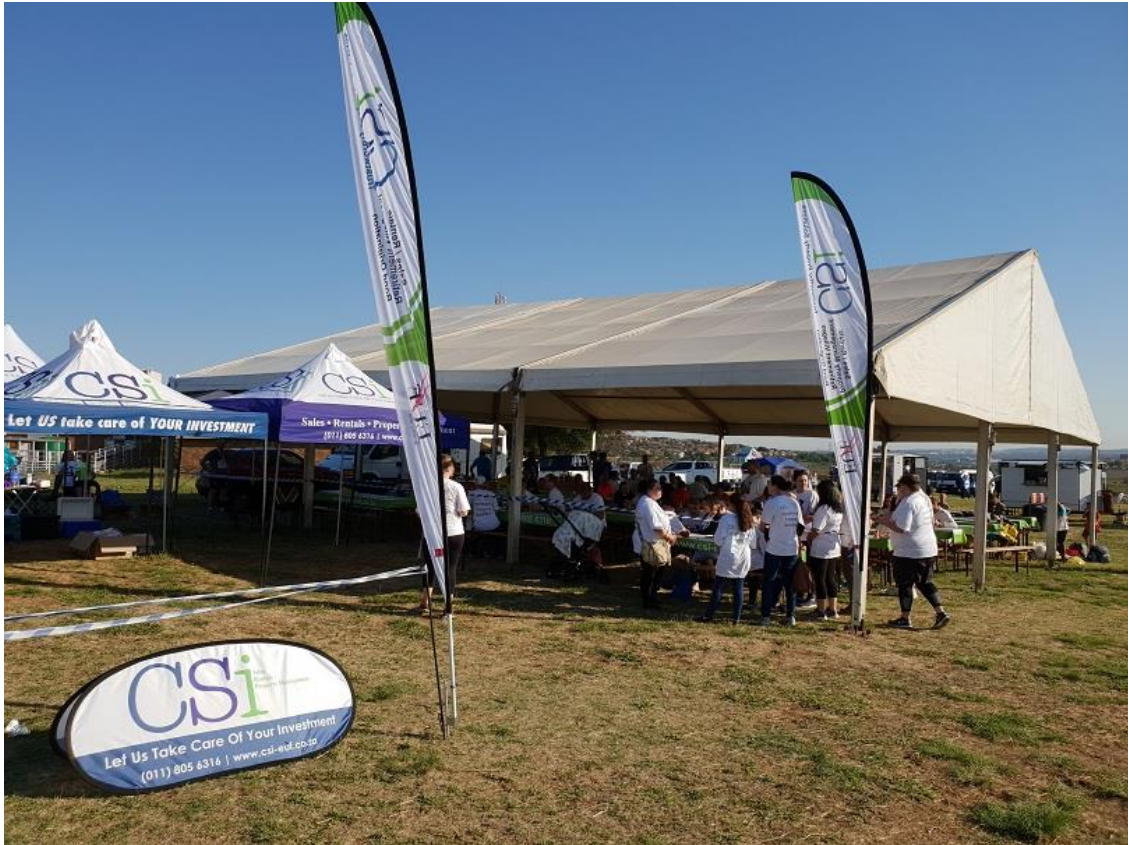
The tent was a winner as always