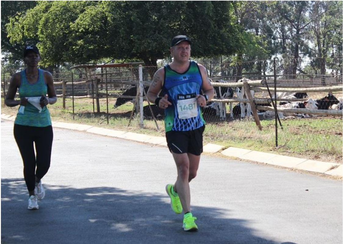
The reason why it is called the CSi Irene Farm Race