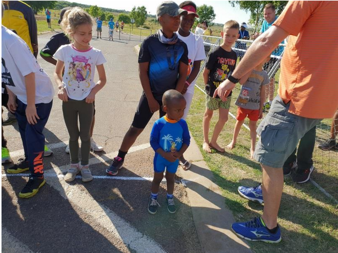
The youngest participant on the day, he was part of the kiddies run