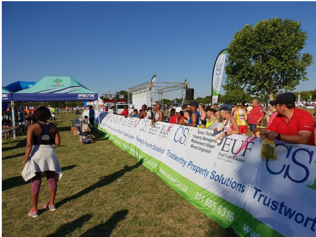
We are proud to be associated with CSI