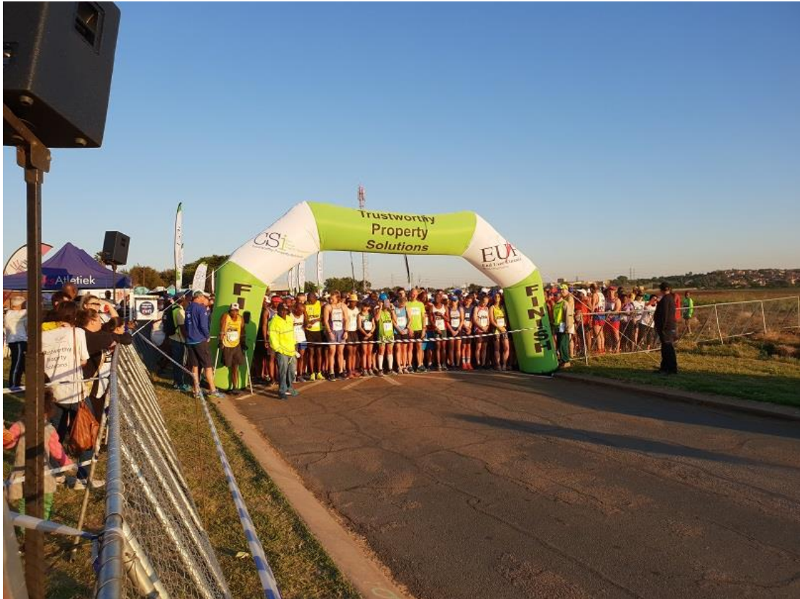
The start of the 25 th edition of this race, this time with CSi as the new sponsor