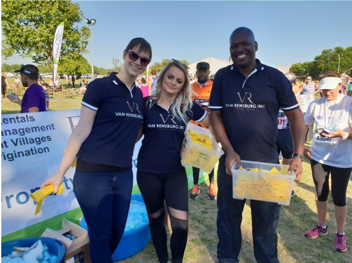
The company who manned the water point at the finish handed out small goodie bags