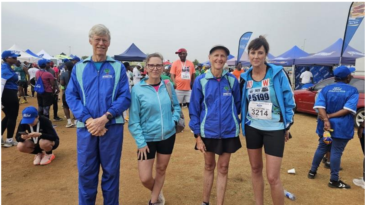
Waiting for the prizegiving to commence