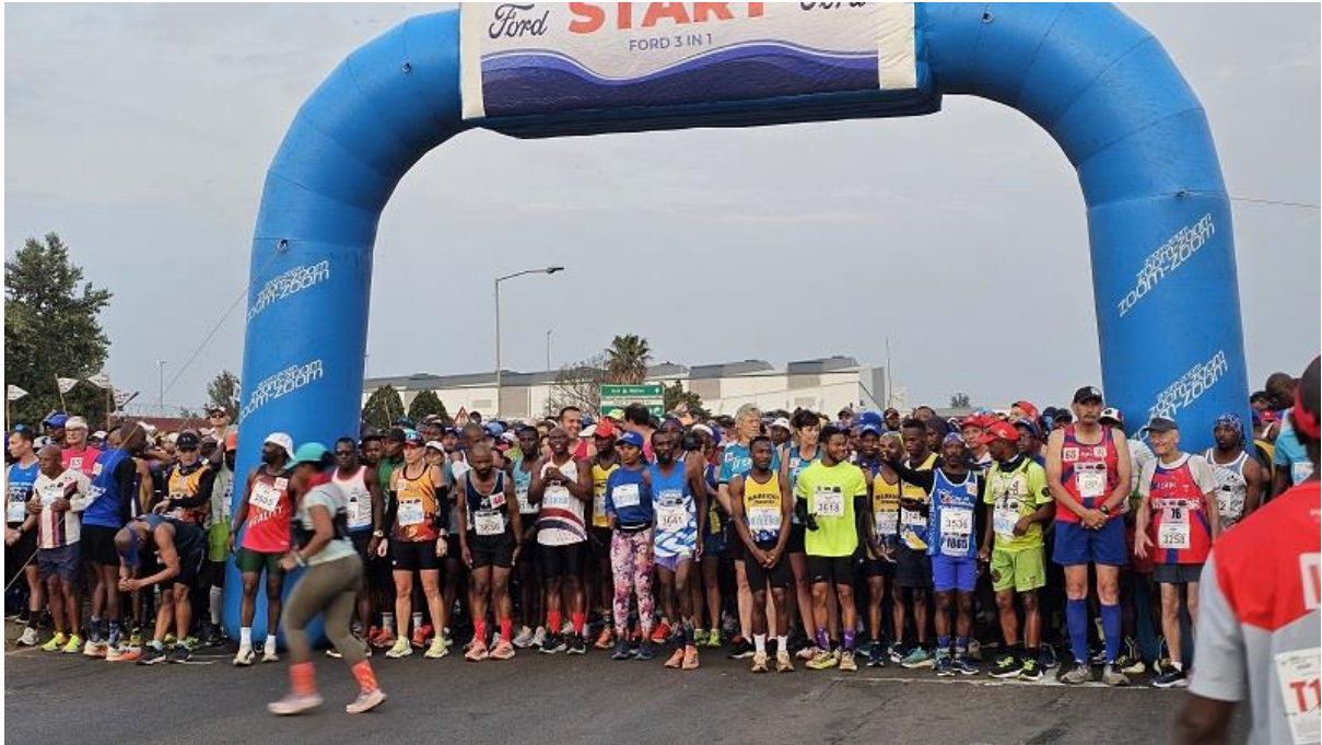
The start of the Ford race on Saturday