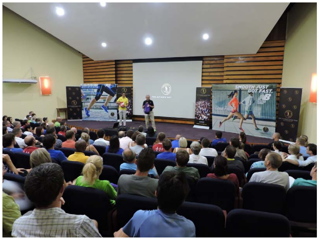
The Comrades Road Show was a huge success. The auditorium was packed