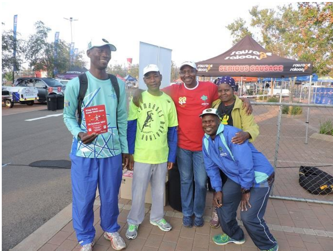
The team whose job it was to hand out the King Price flyers