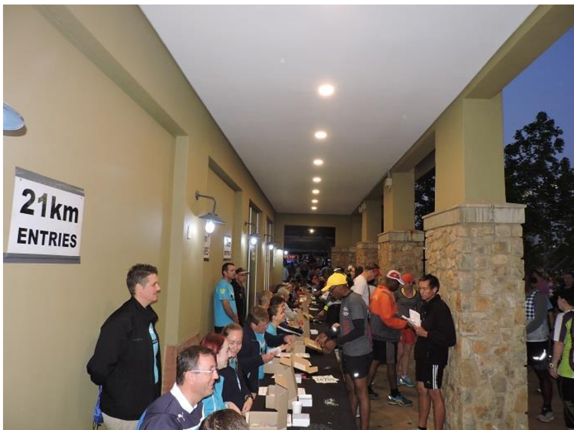
The registration area was well organized and able to cope with the masses