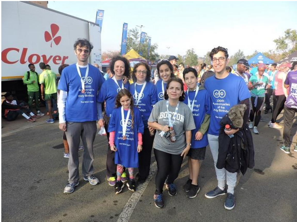
They came from all over to participate