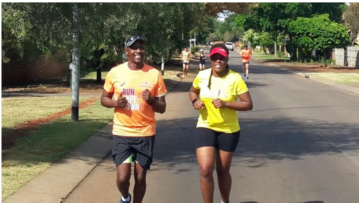
The helpers race was very successful