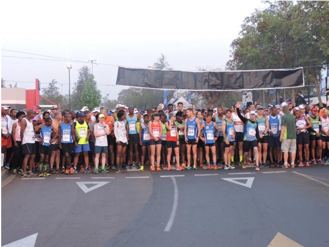
Ready for action