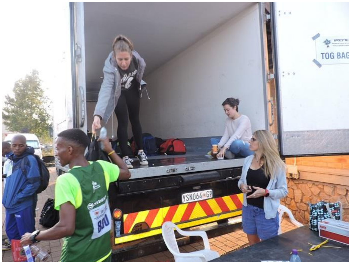
The tog bag team