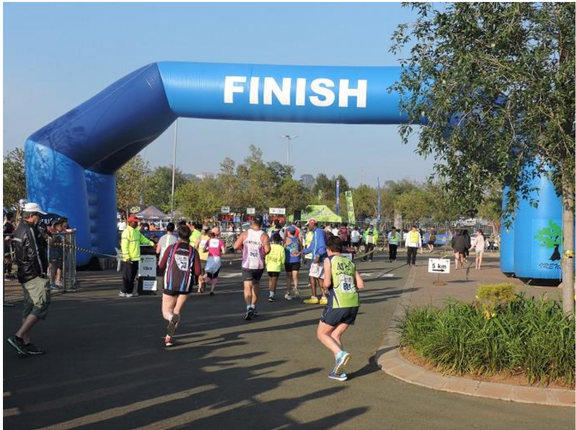
Our finish structure, impressive as always