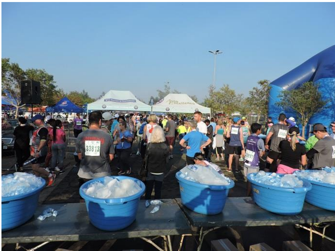
The water point at the finish