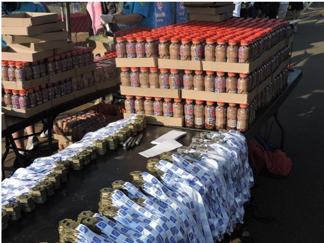
Super M milk was served at the finish before the medals were collected