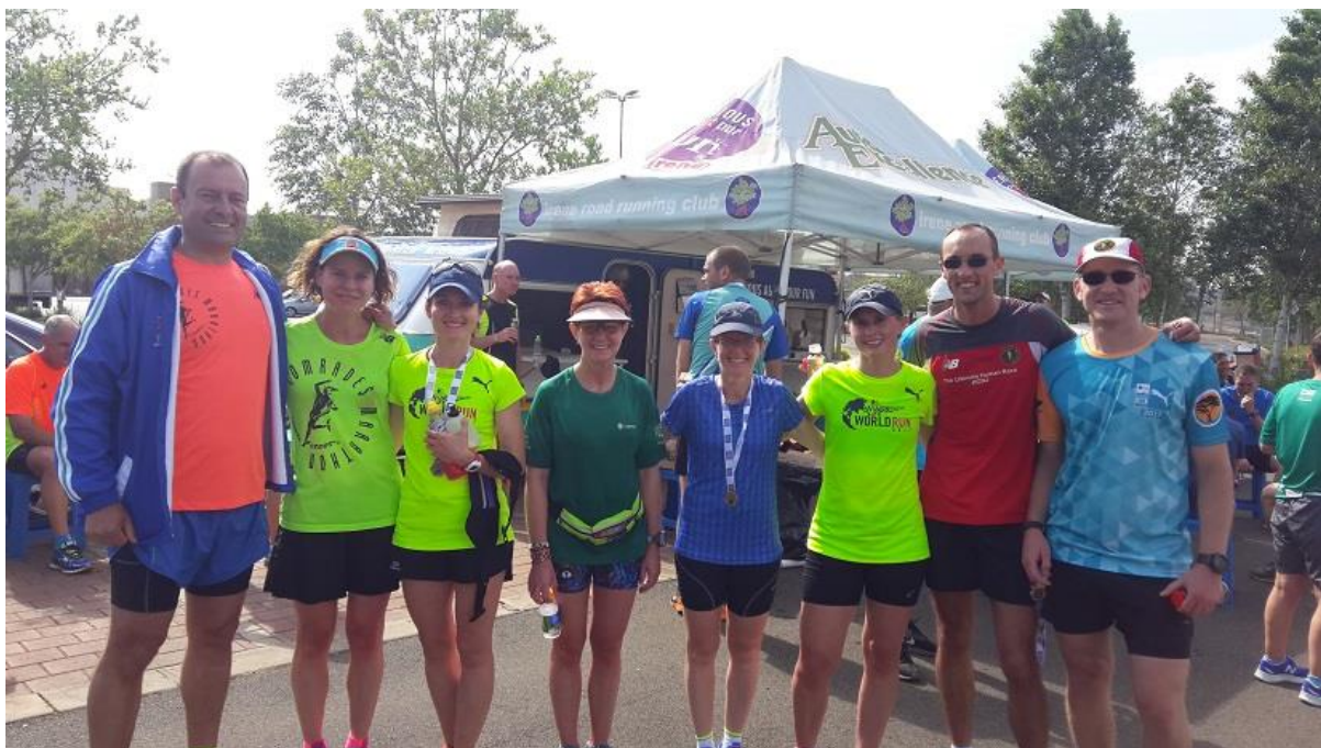
They obviously enjoyed the helpers race