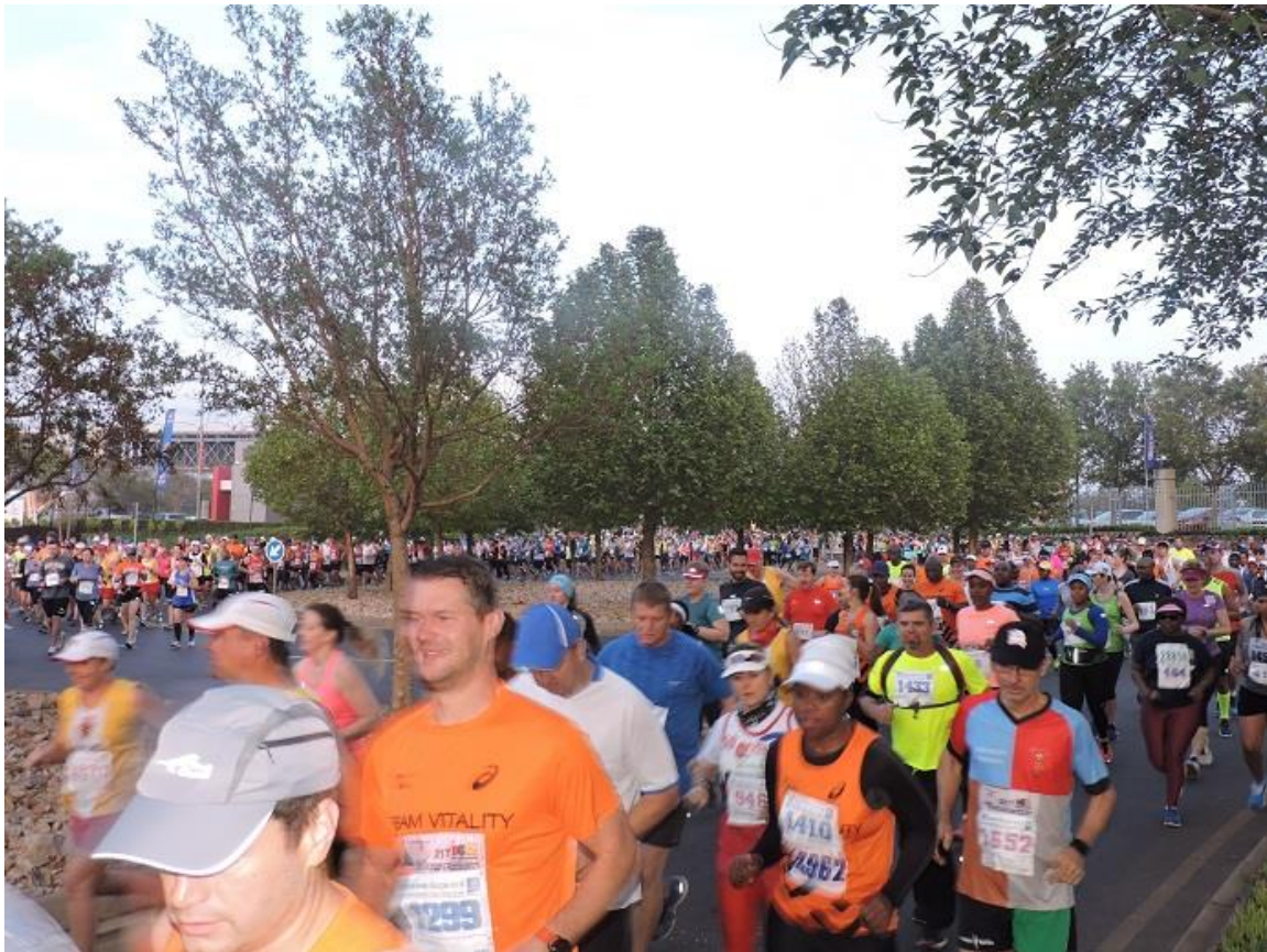
Away they go