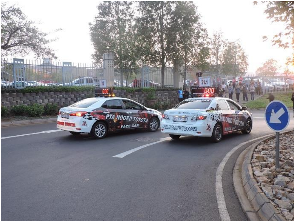
The lead cars in position