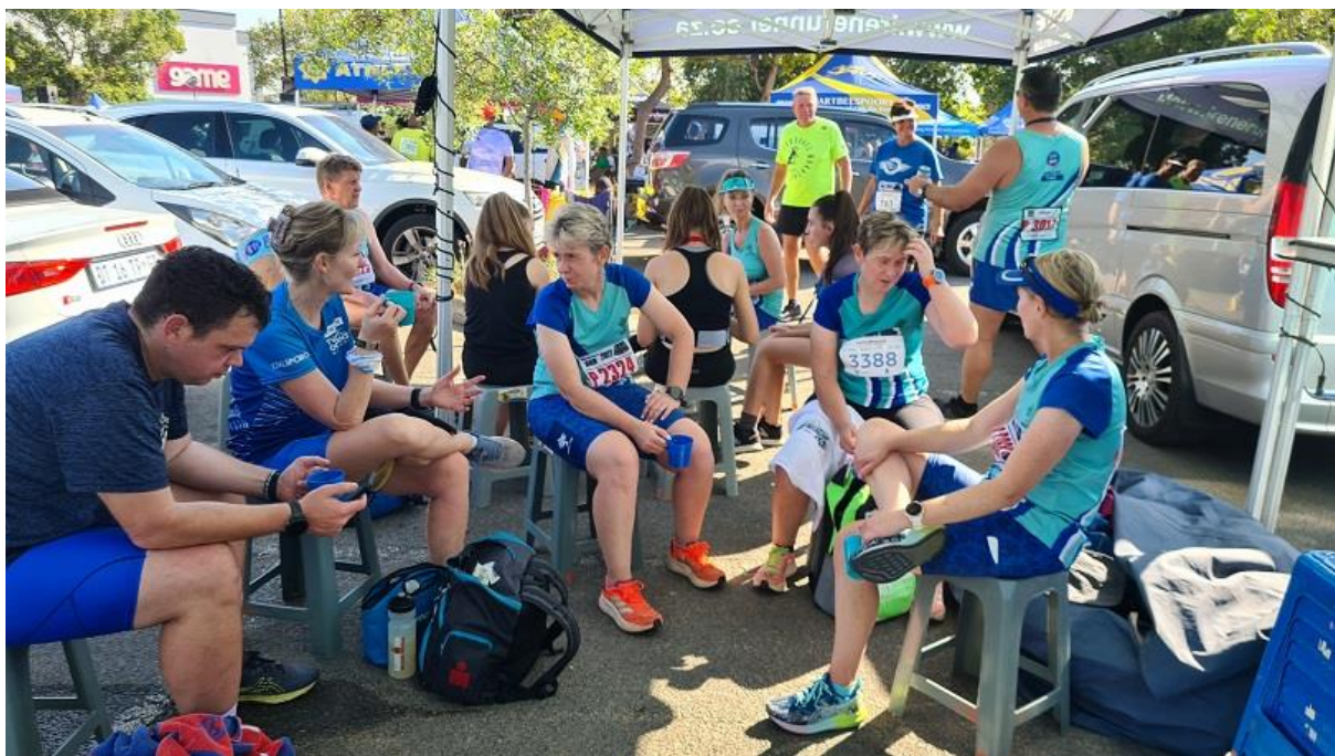
Relaxing after the Akasia race