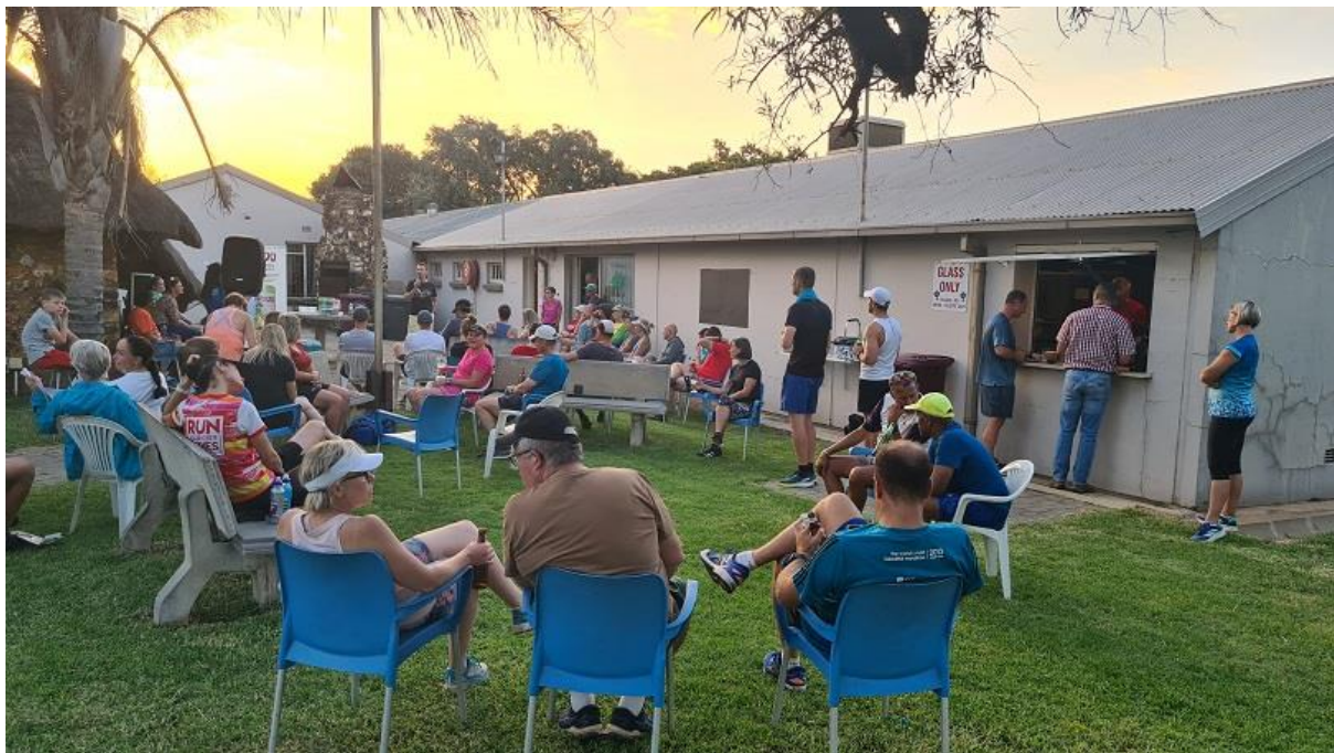
A lovely evening at the club house