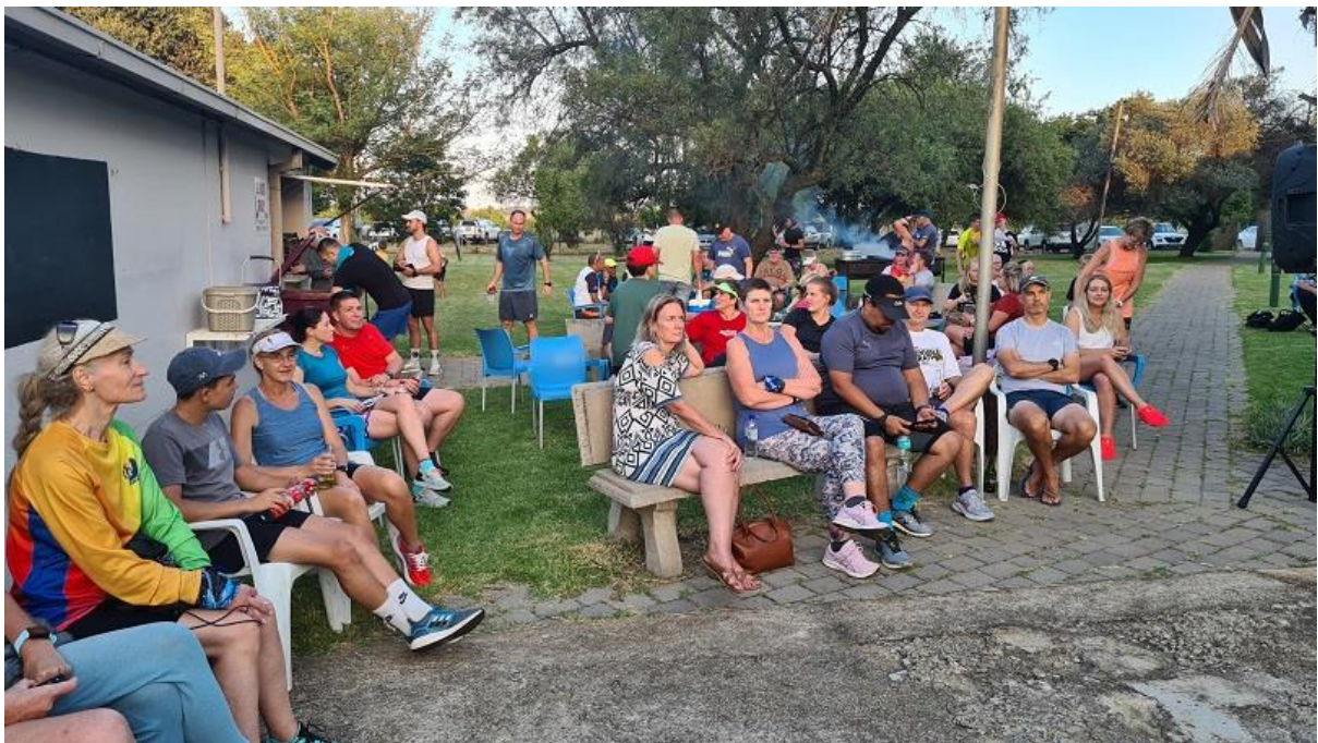
Ready for the nutrition talk