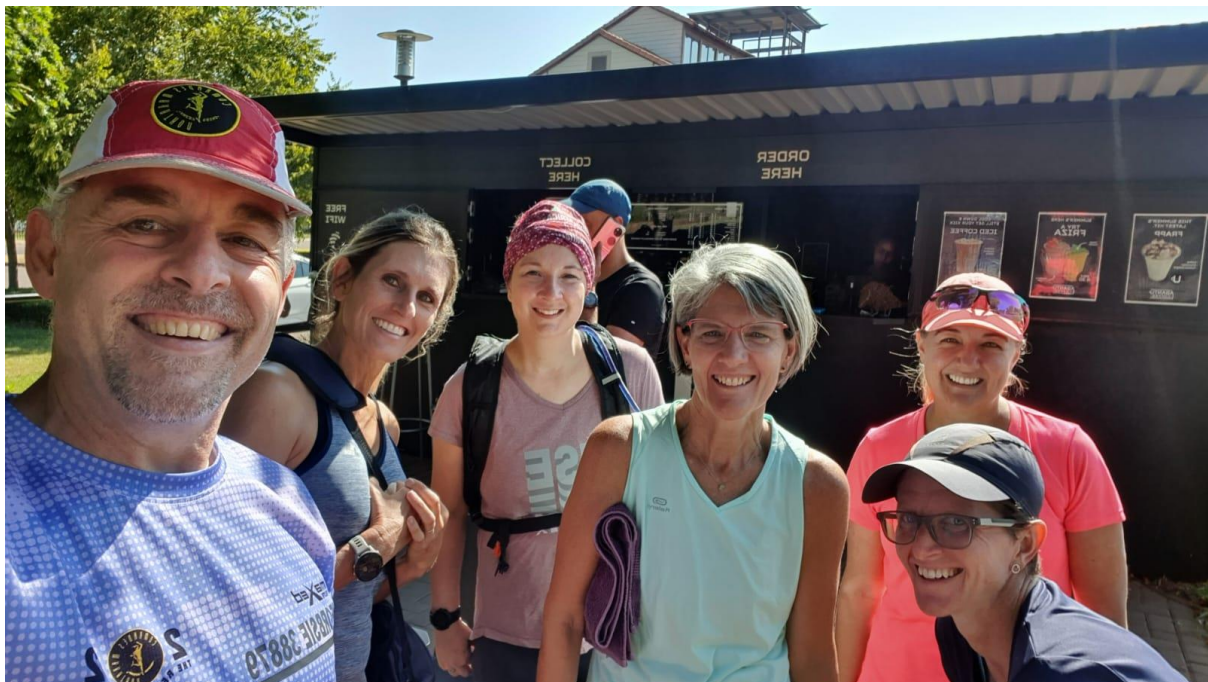
Training group at Eco Park