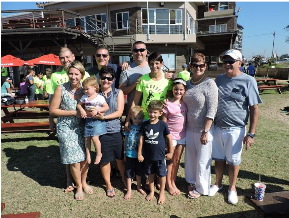
The Calaca family at the post function