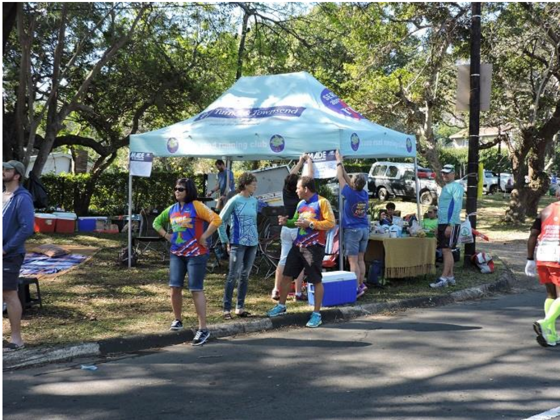
The support station at Cowies