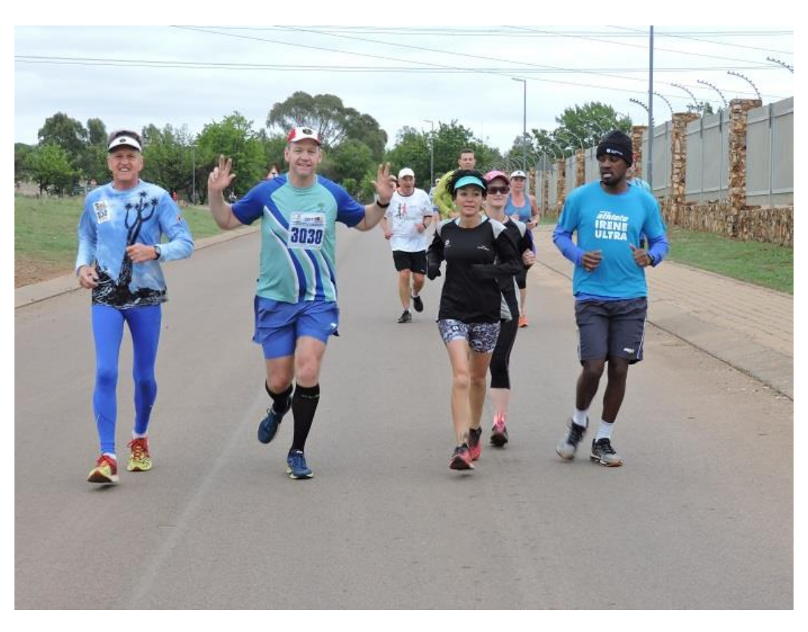
The helpers race was more fun than anything else