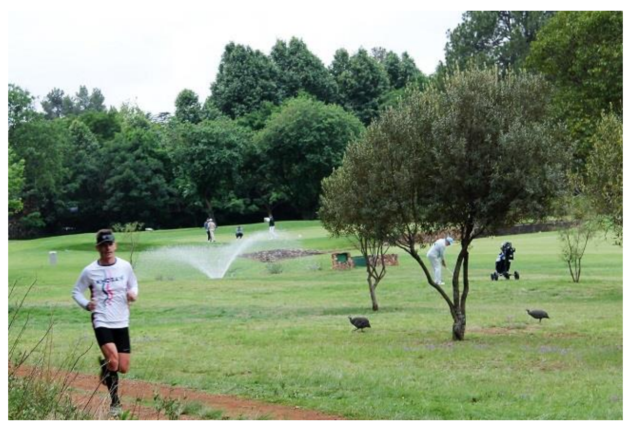
The Irene golf course is part of the 21 km route