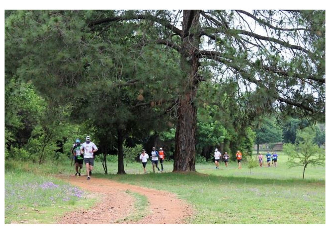
Runners enjoying the nature