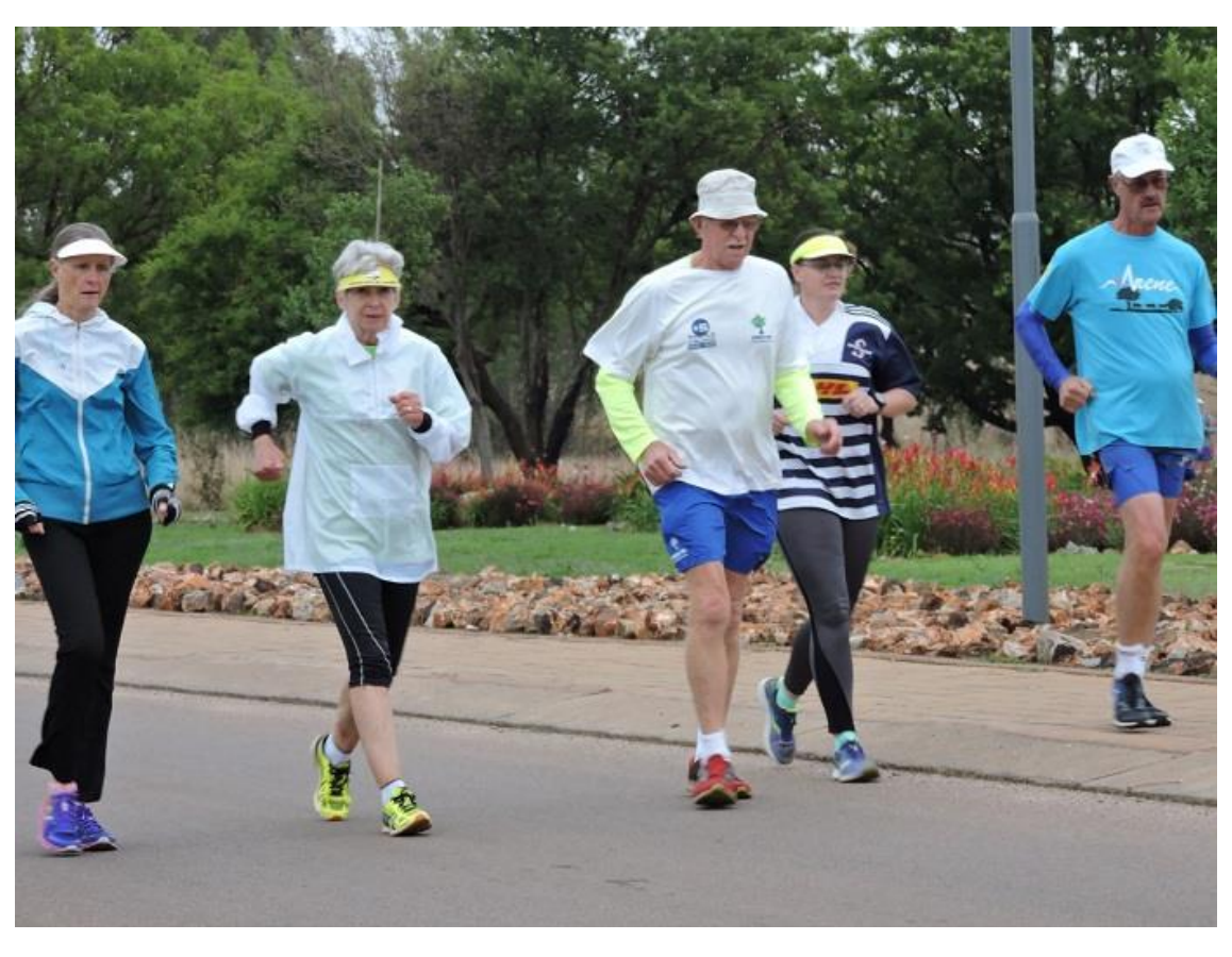
The walkers took it a bit more seriously