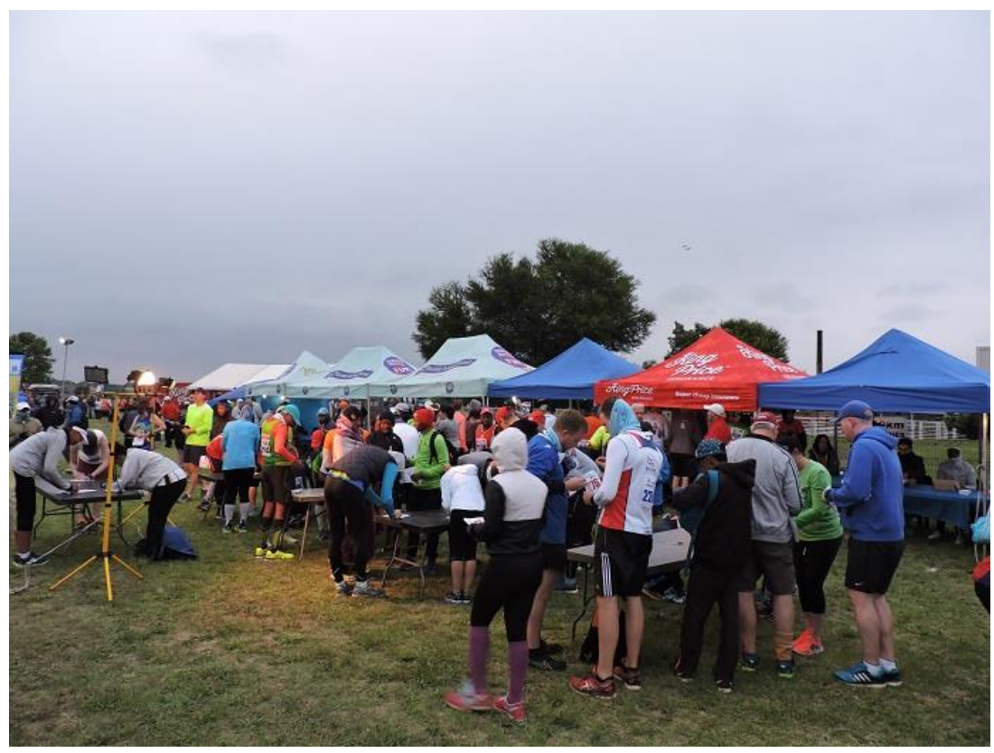
Athletes braving the cold to enter for the King Price Irene Farm Race