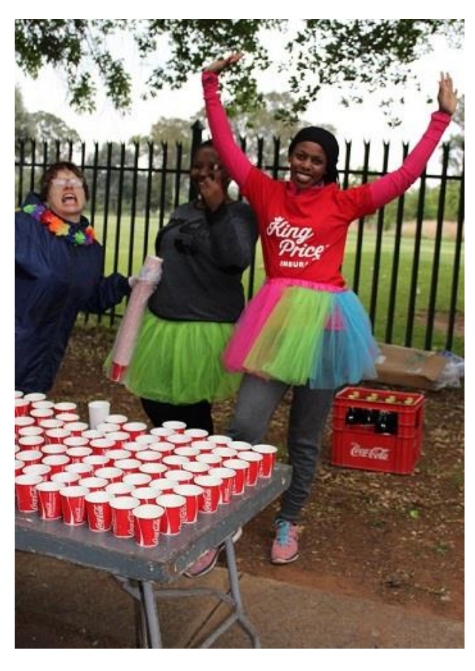
Working at a water point is more fun than anything else