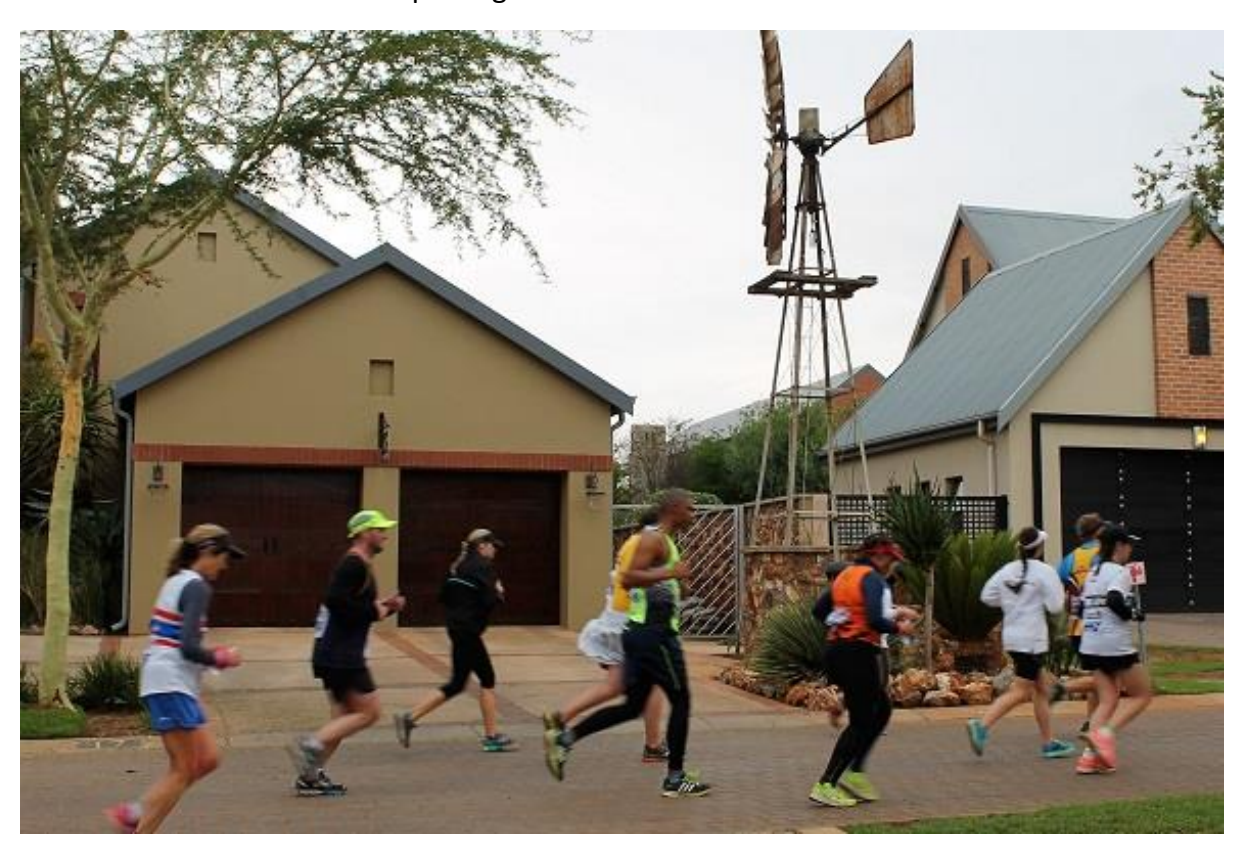
Running through Southdowns Estate is also very special