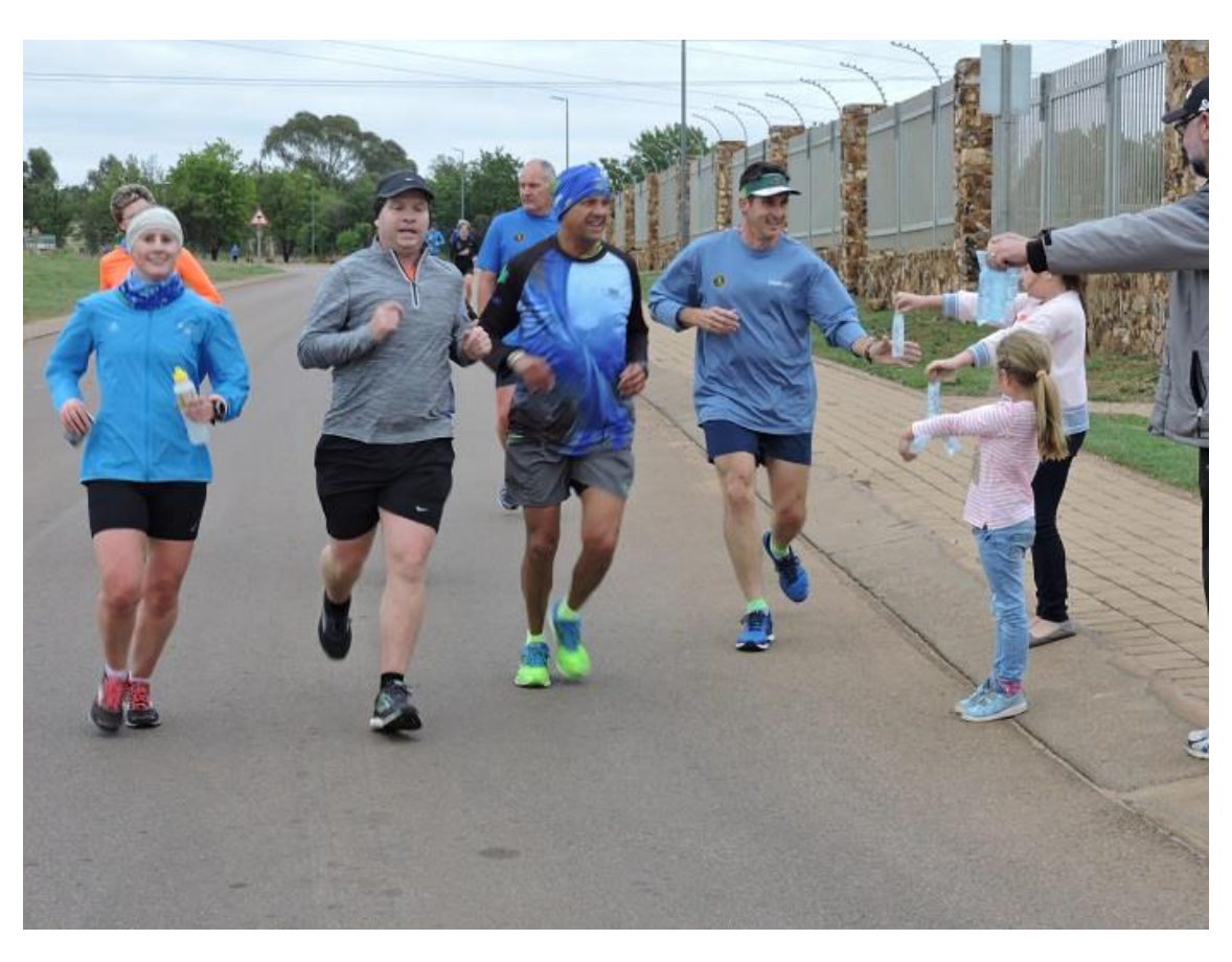
The du Plessis kids handing out water at the helpers race