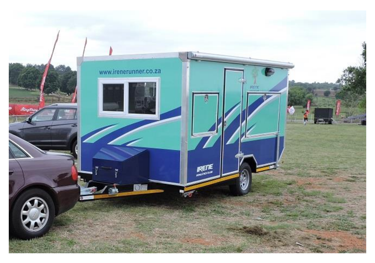
Our new service vehicle was on display at the race