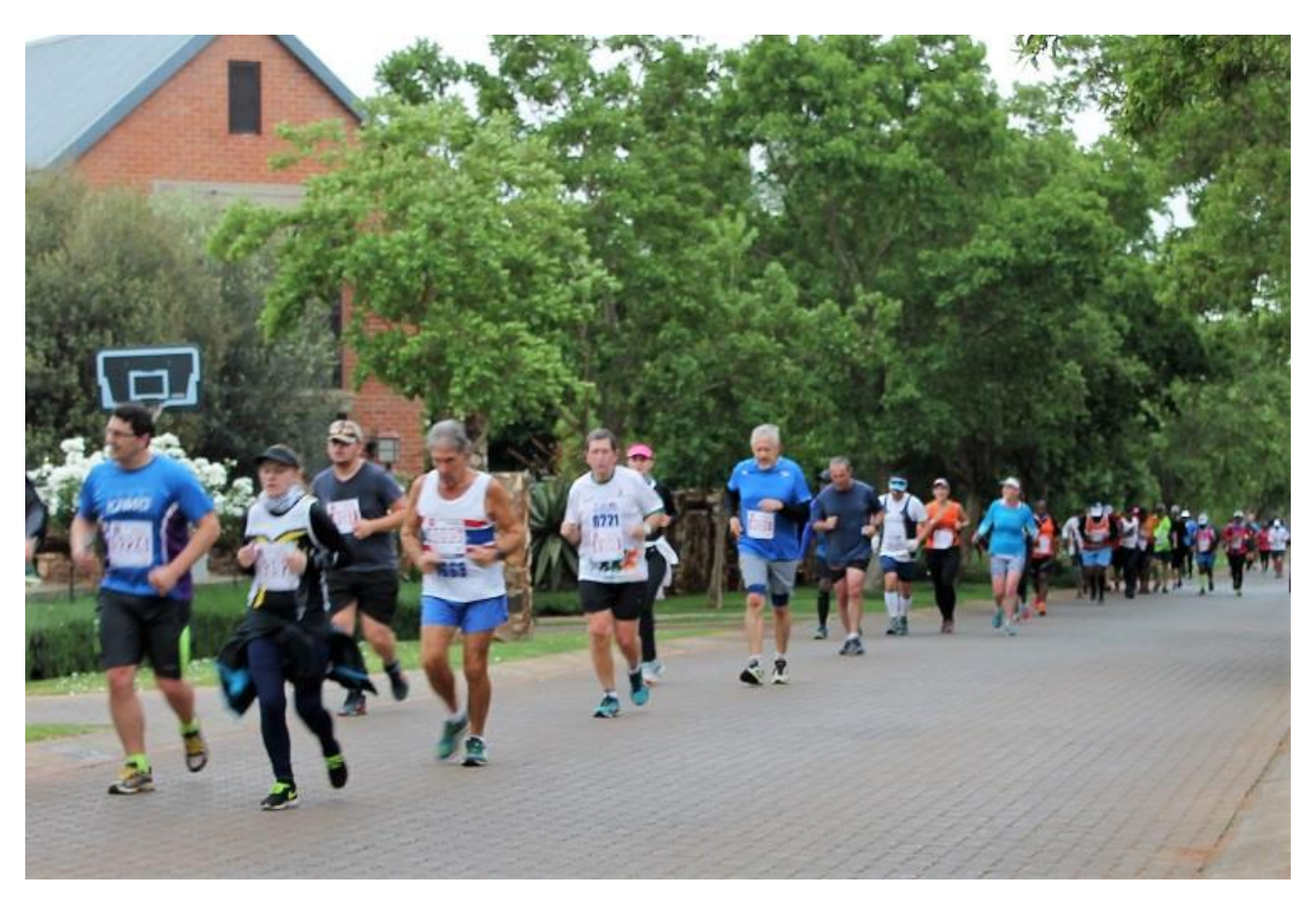
Another tranquil street in Southdowns Estate