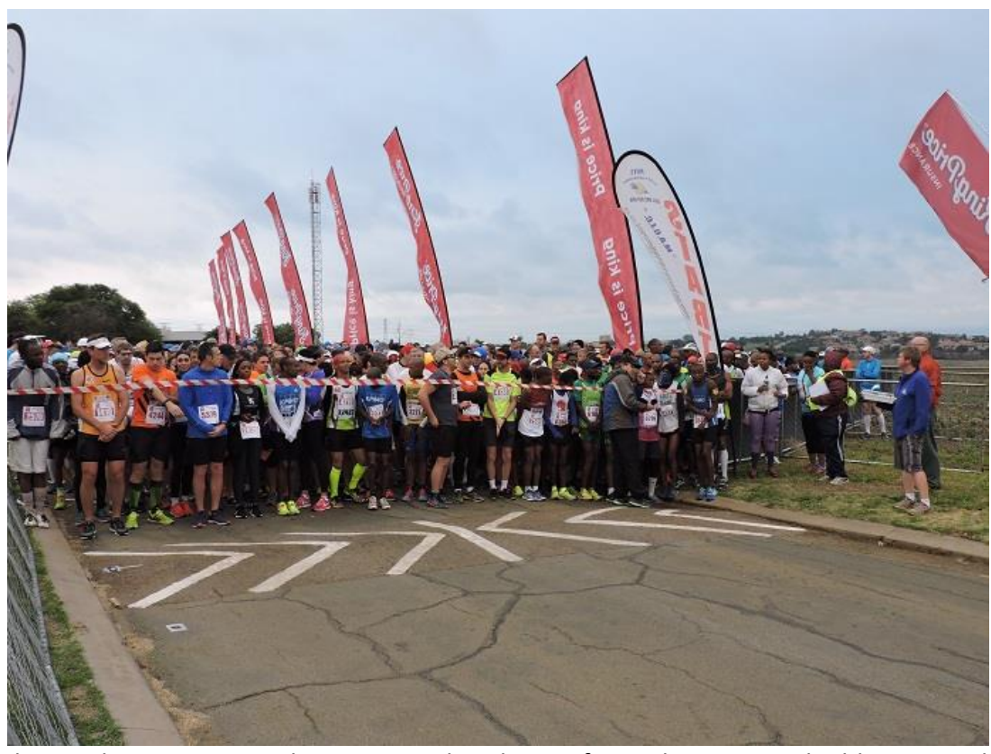
The wind was so strong that we considered it a safety risk to put up the blow-up arch