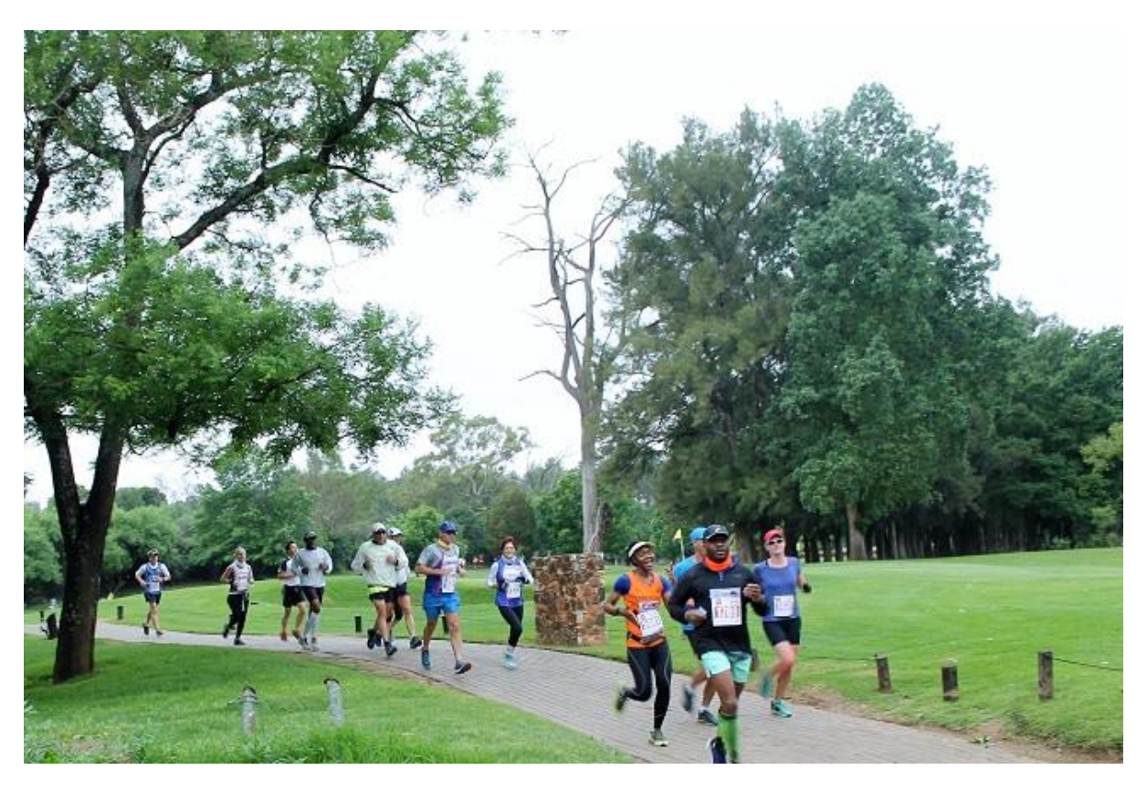
What a privilege to run in such an environment!