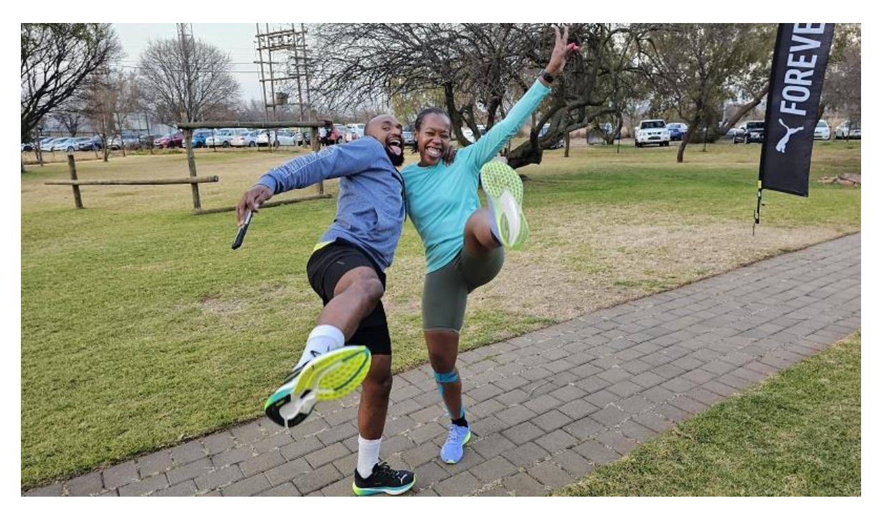
Another way to show off