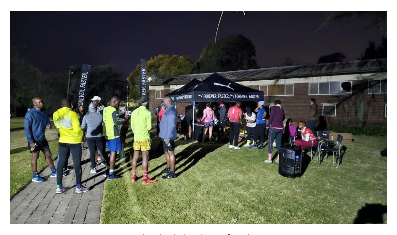
Handing back the shoes after the run