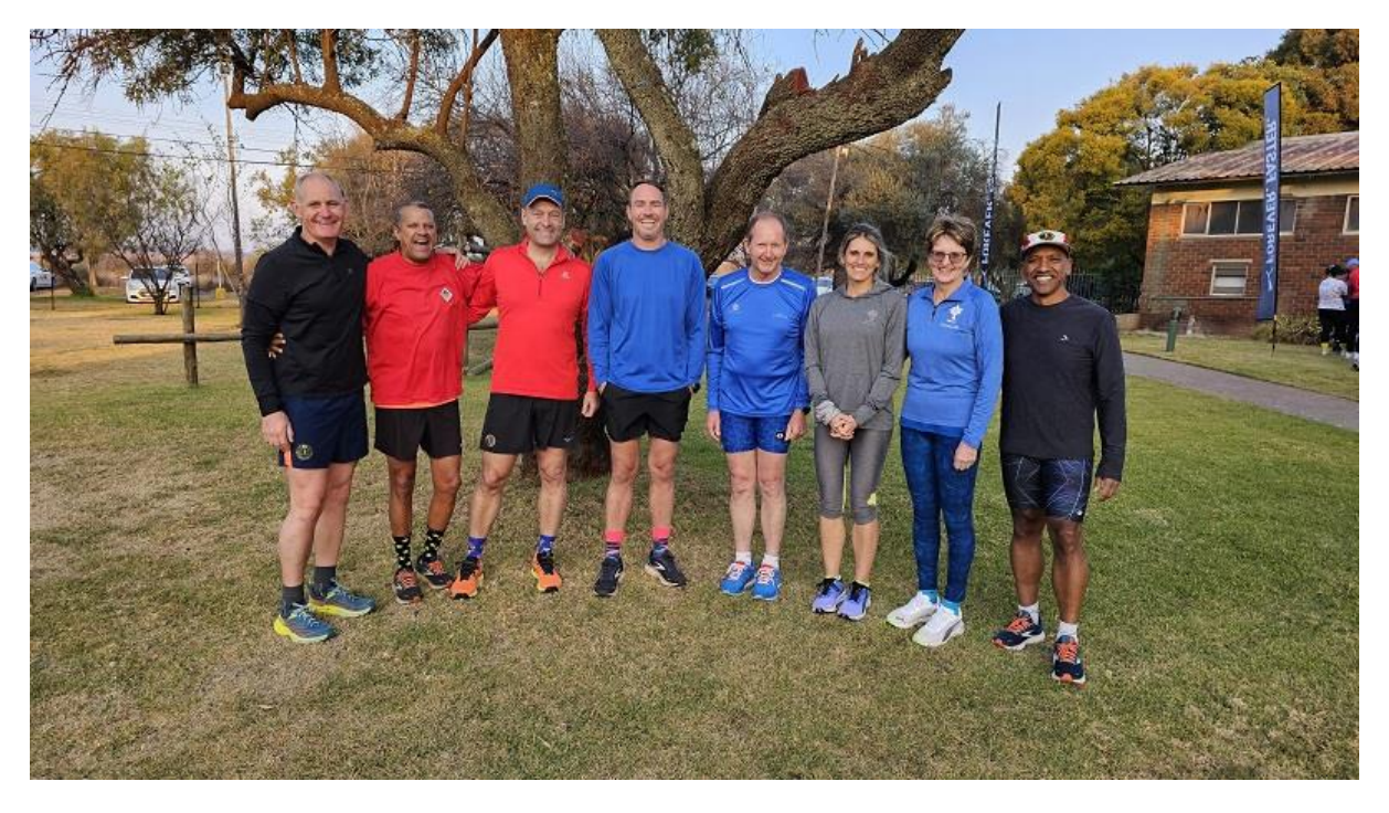
Fires with his crew to run the upcoming back yard ultra route