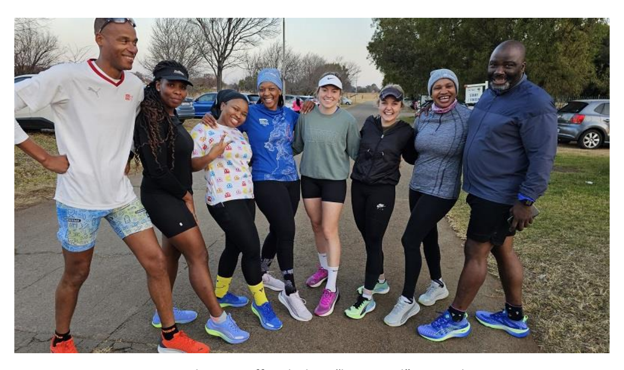
Runners showing off with their "borrowed" Puma shoes