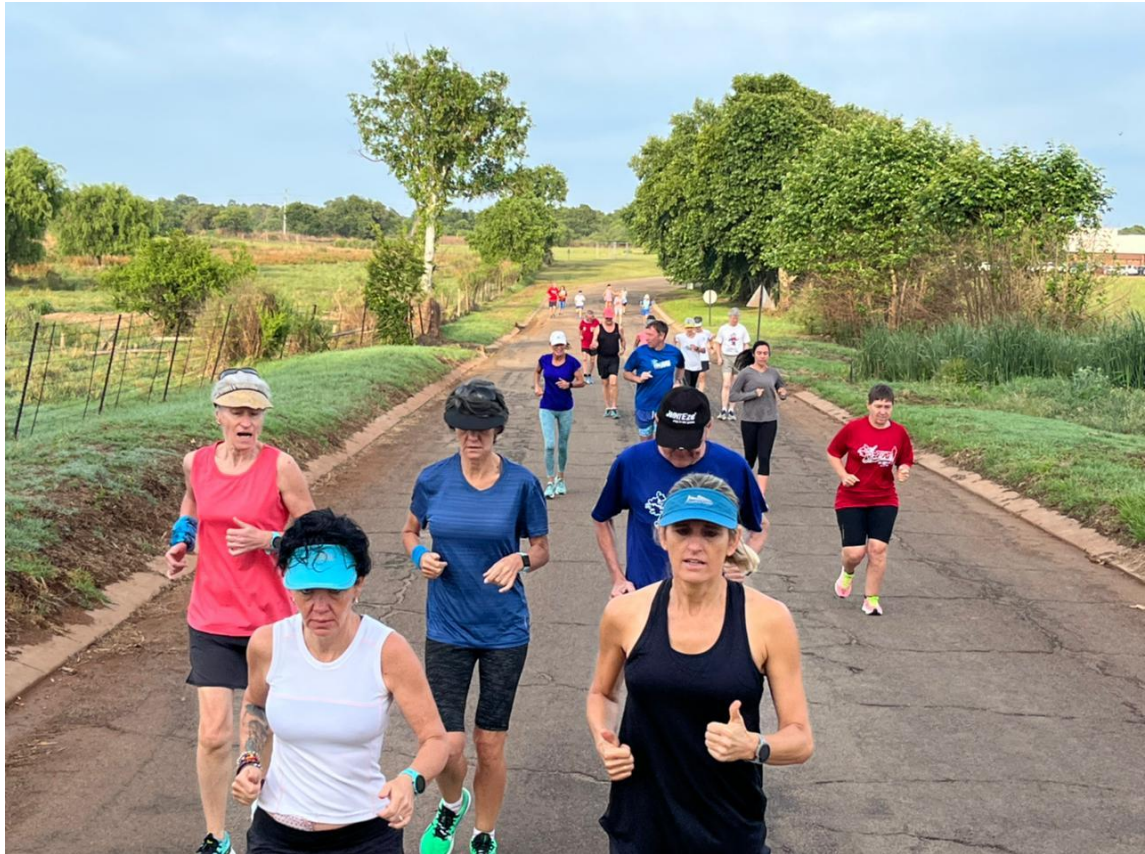
Taken at the helpers run on Sunday