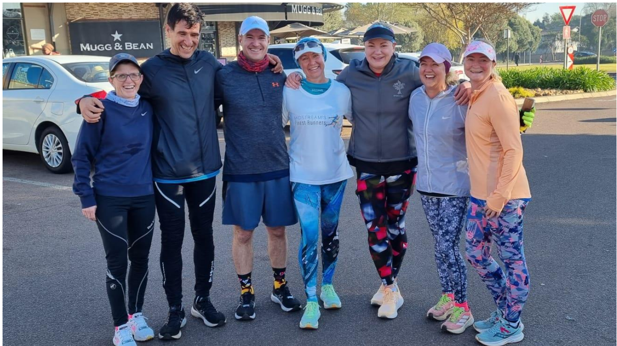
Sunday social run