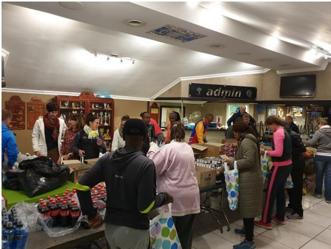
The packing of the goodie bags each year is such a fun occasion