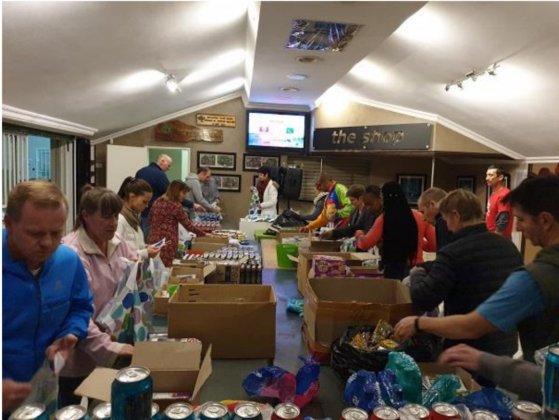
The goodie bag "packing crew" at work