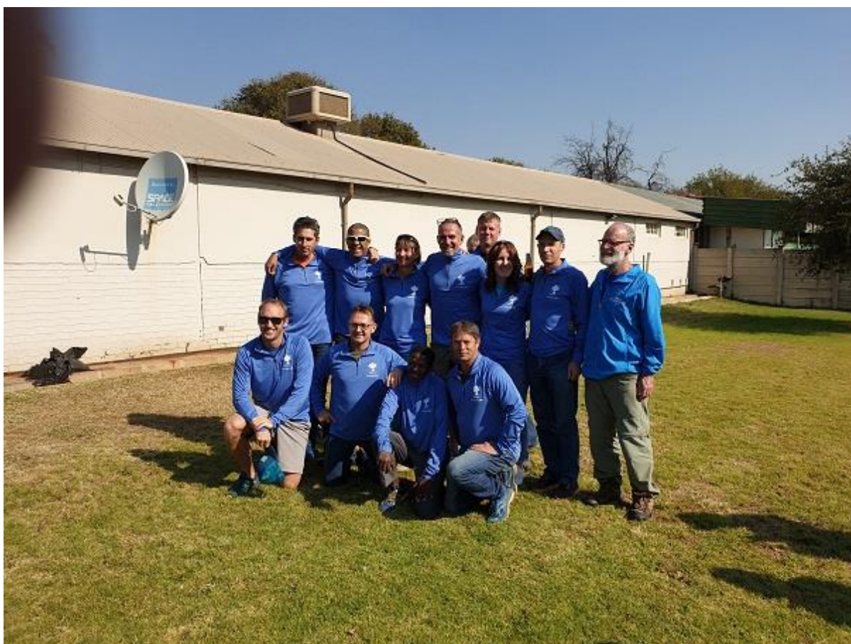
They will all be running with green numbers