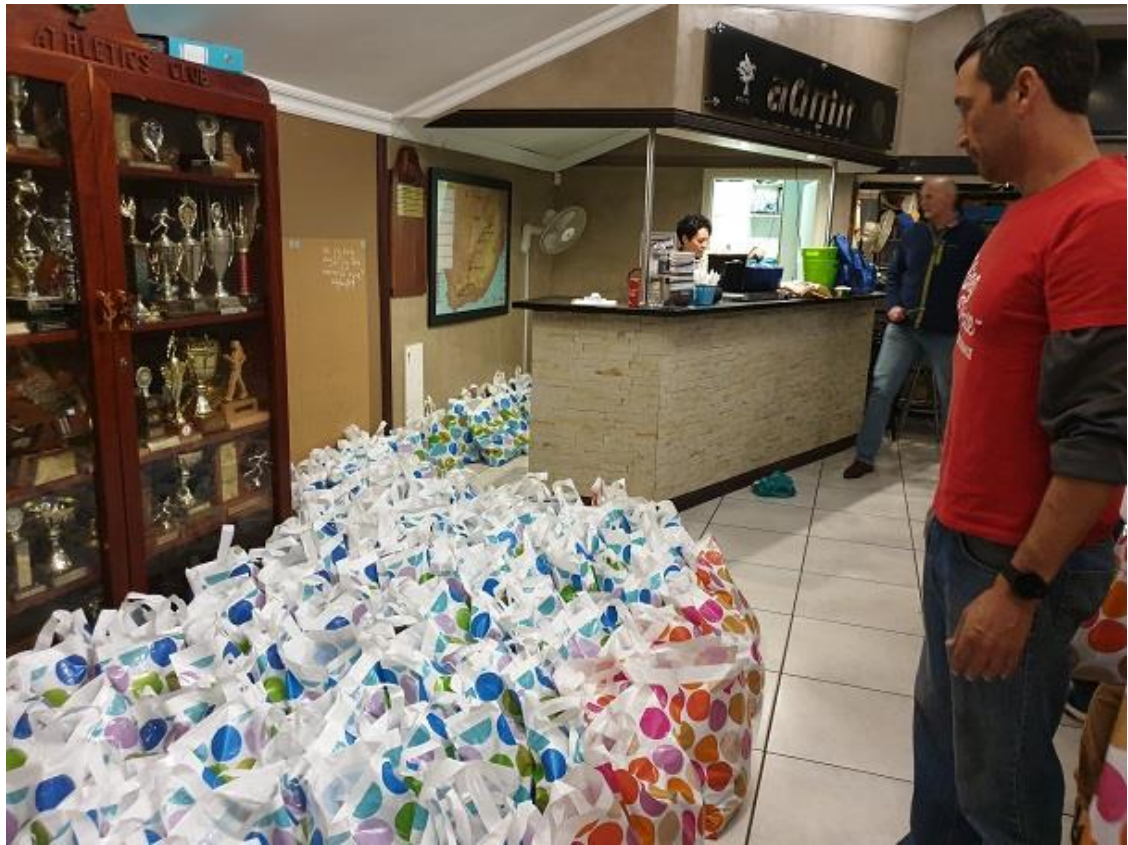
The end result – 170 goody bags ready to be handed out