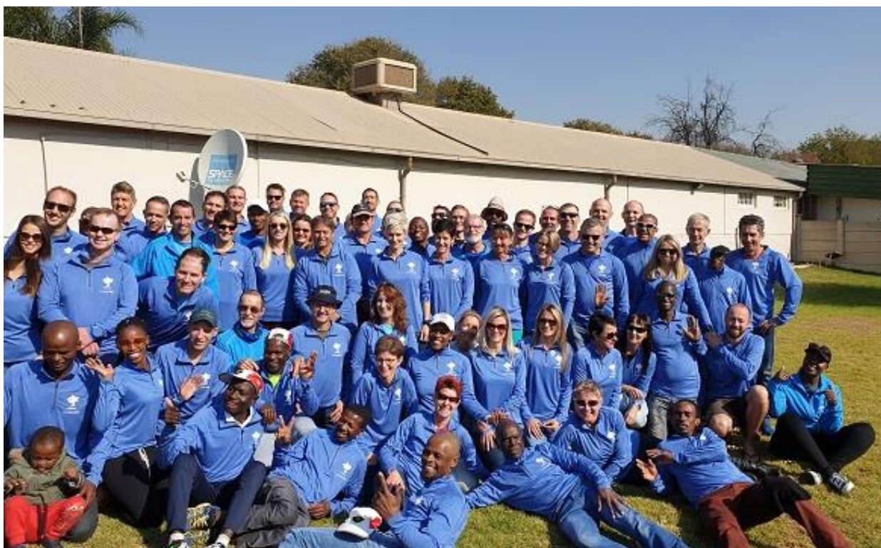
Comrades runners with their new shirts