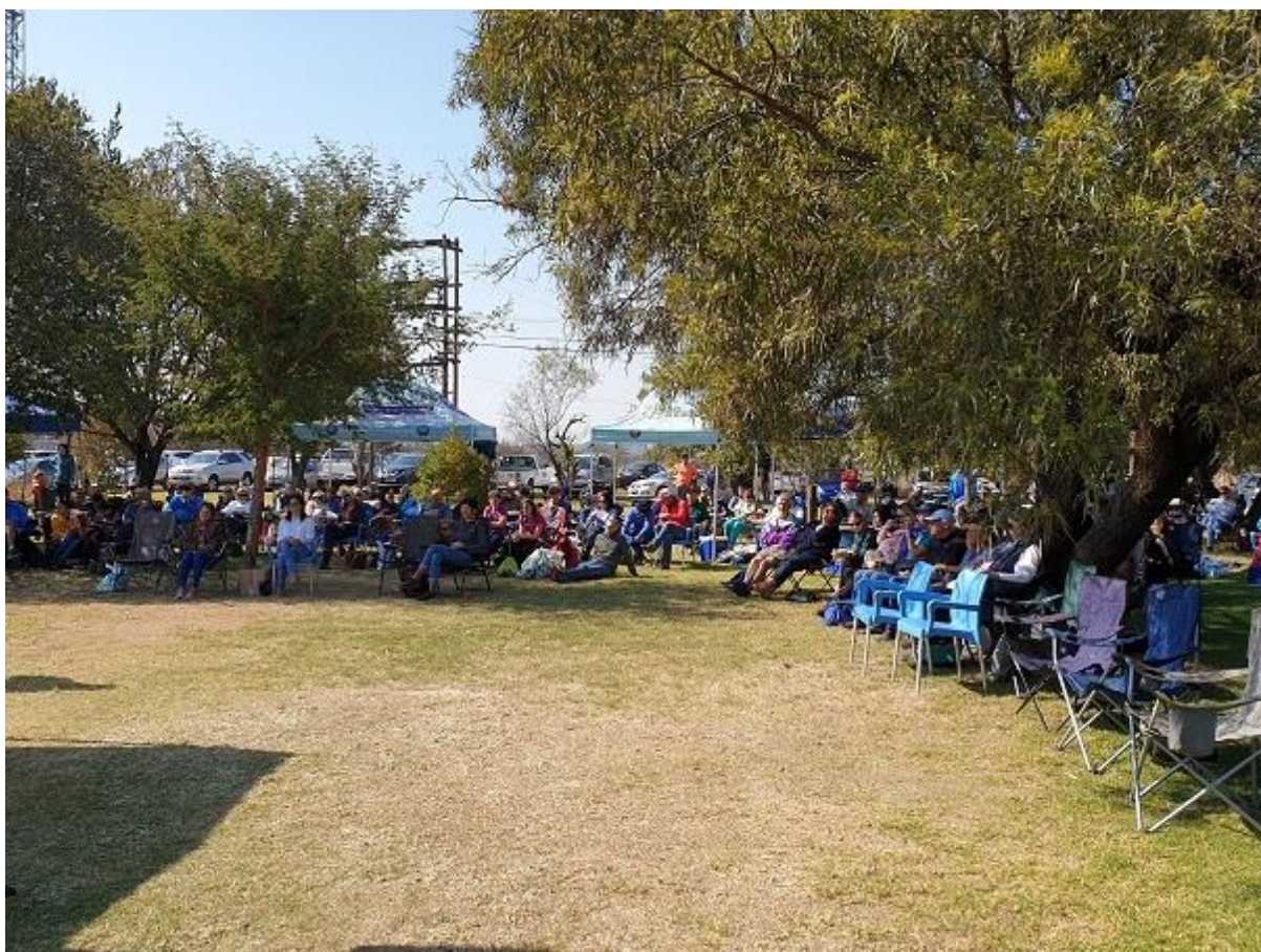
A glorious day it was indeed