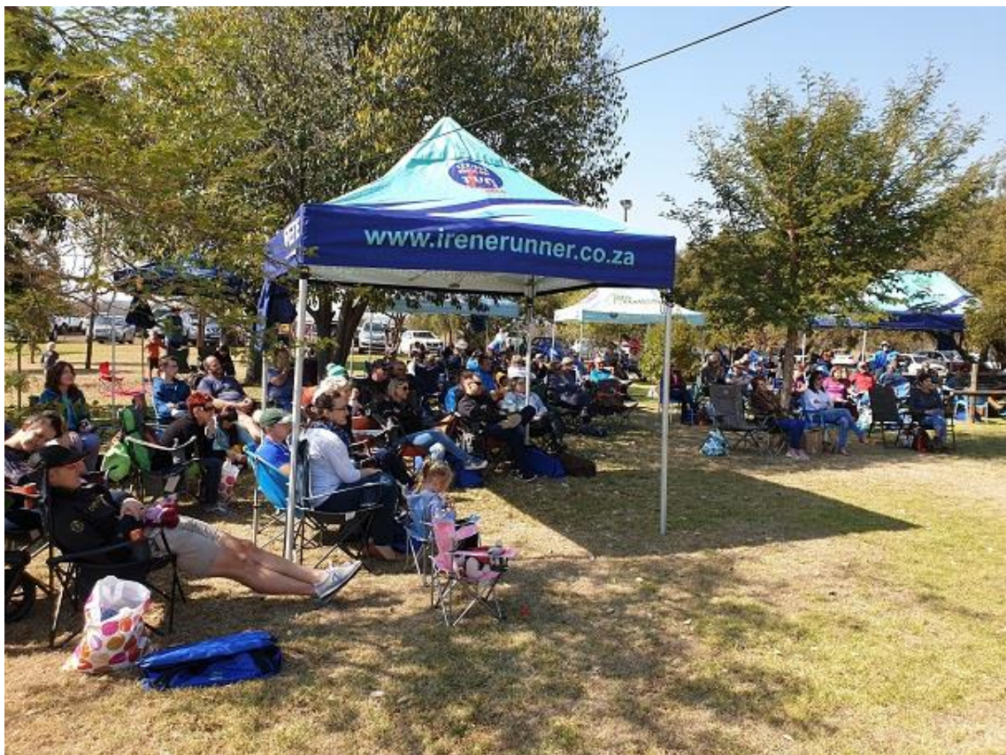
There was an excellent turnout at the pre-function on Saturday