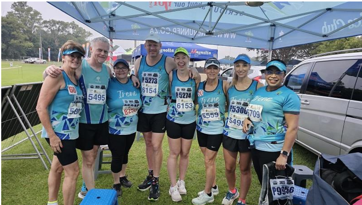
Some of the 10 km runners lining up at the club gazebo