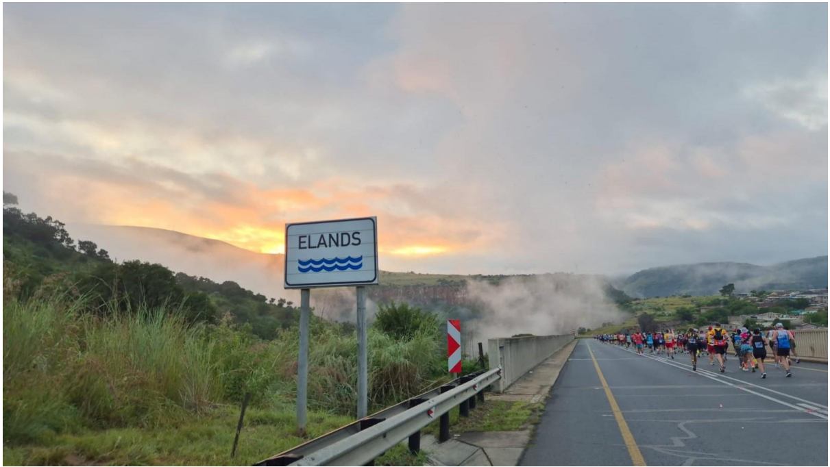
Runners of the Elands Marathon on their way