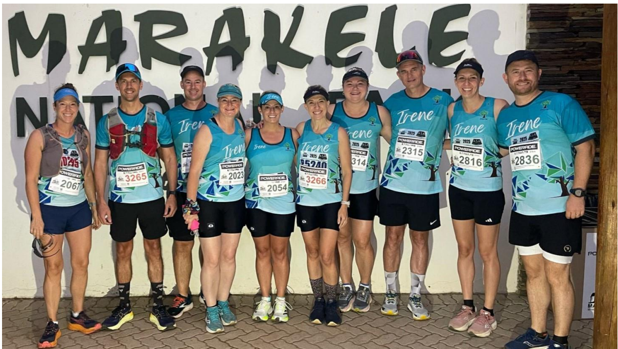
We were well represented at the Marekele Marathon