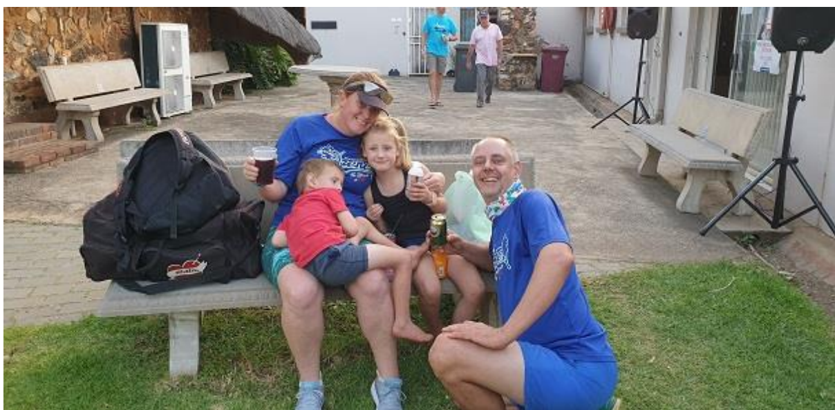
The Faling family