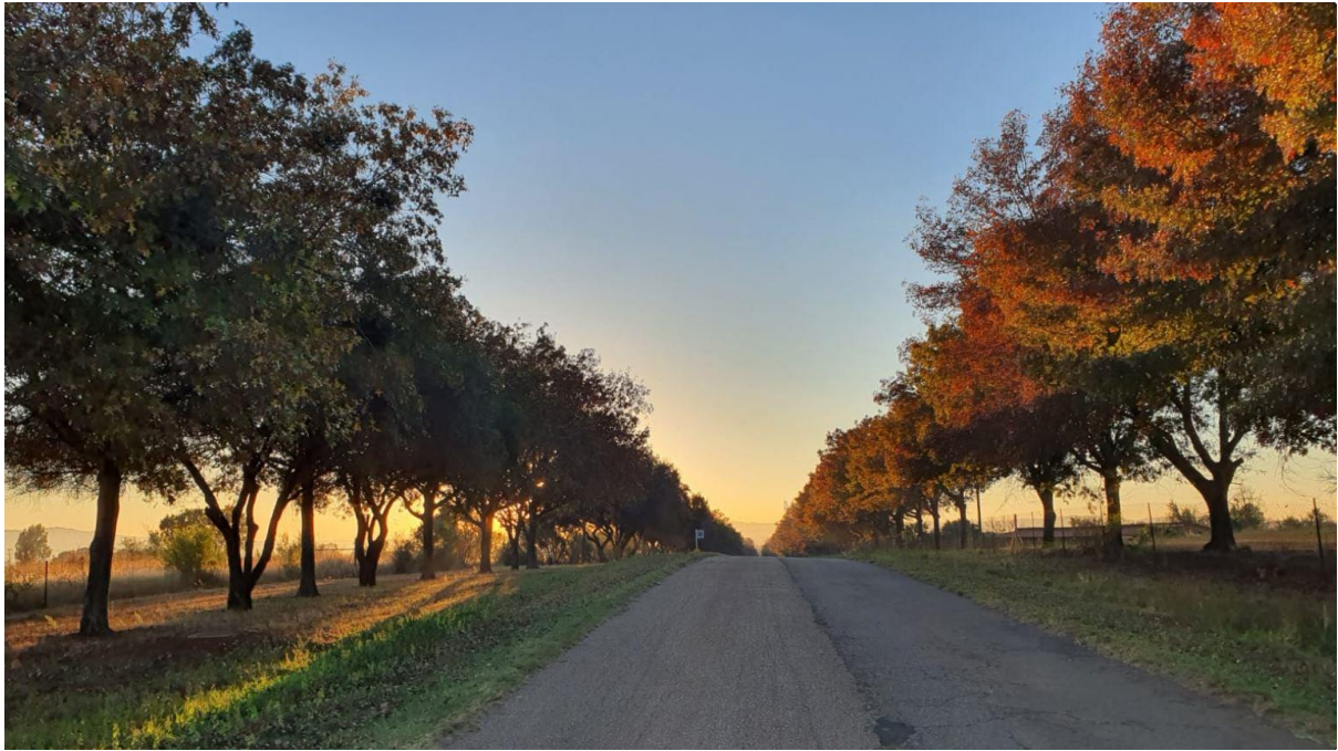
A beautiful morning on the farm. Such a privilege to have our club there