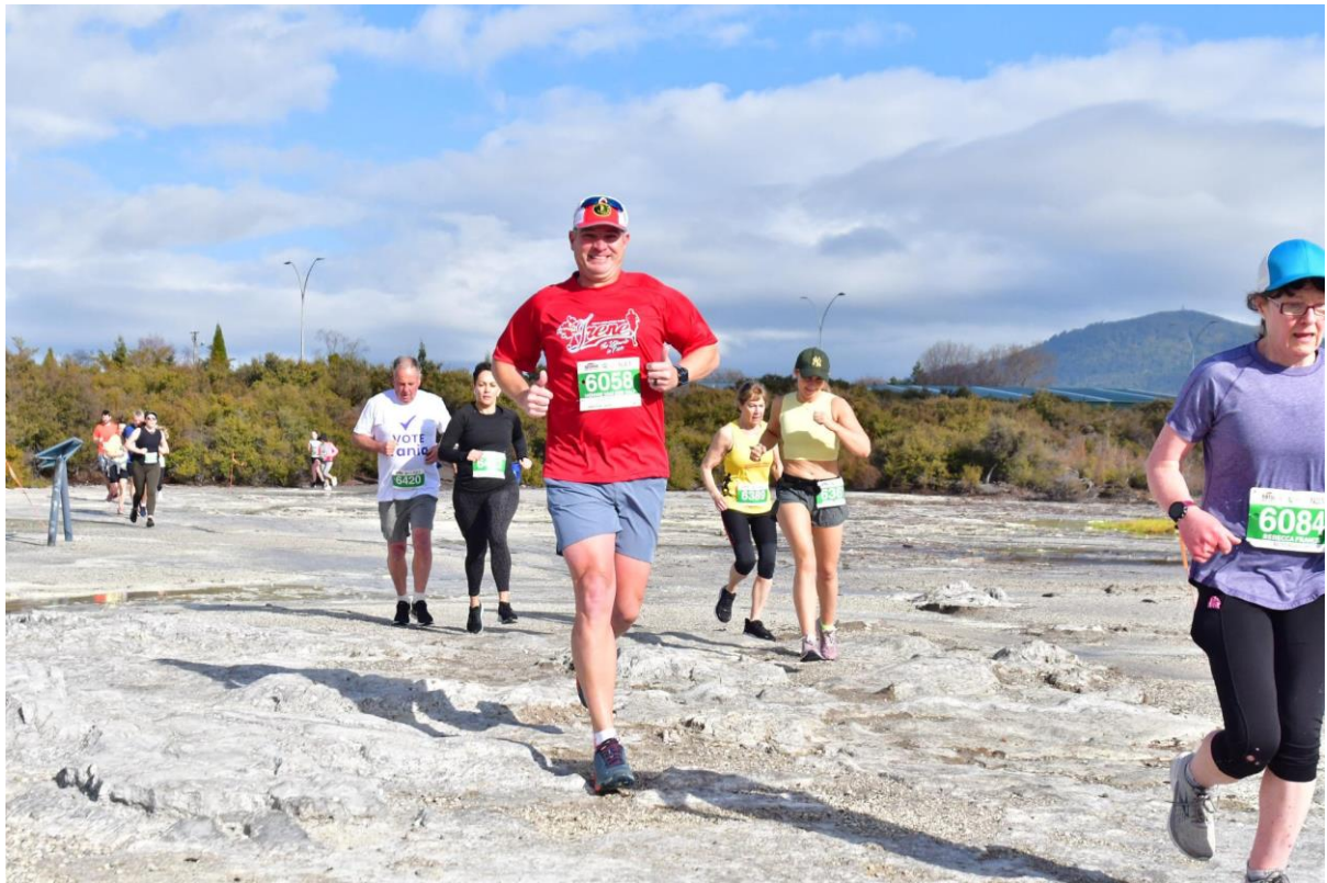
The Rotorua 10 km