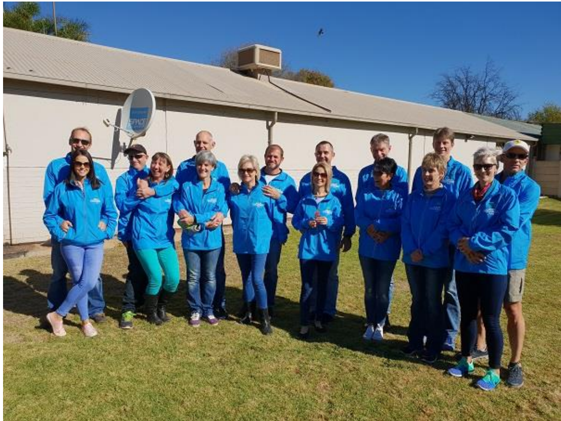
A number of couples running Comrades this year