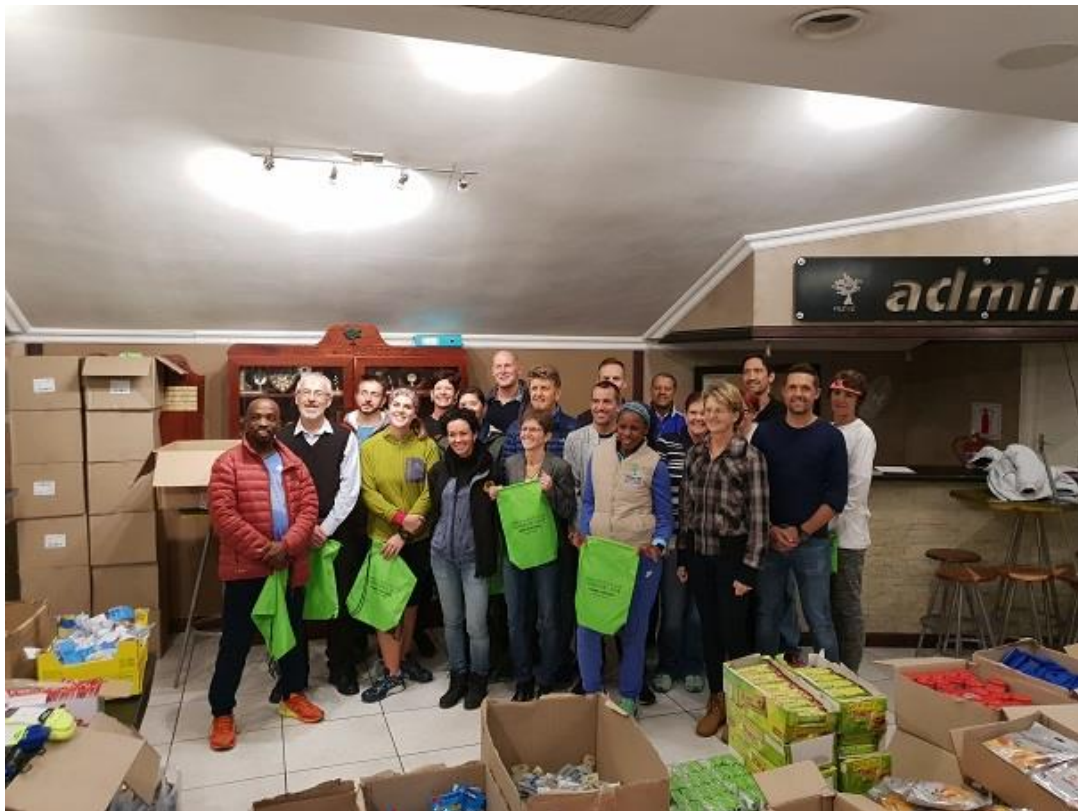
The packing team