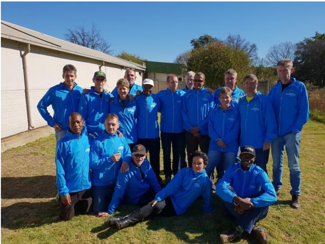
They will be running with green numbers