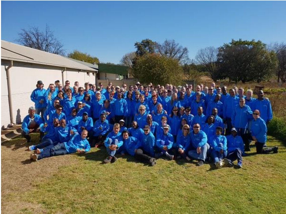
Our Comrades runners