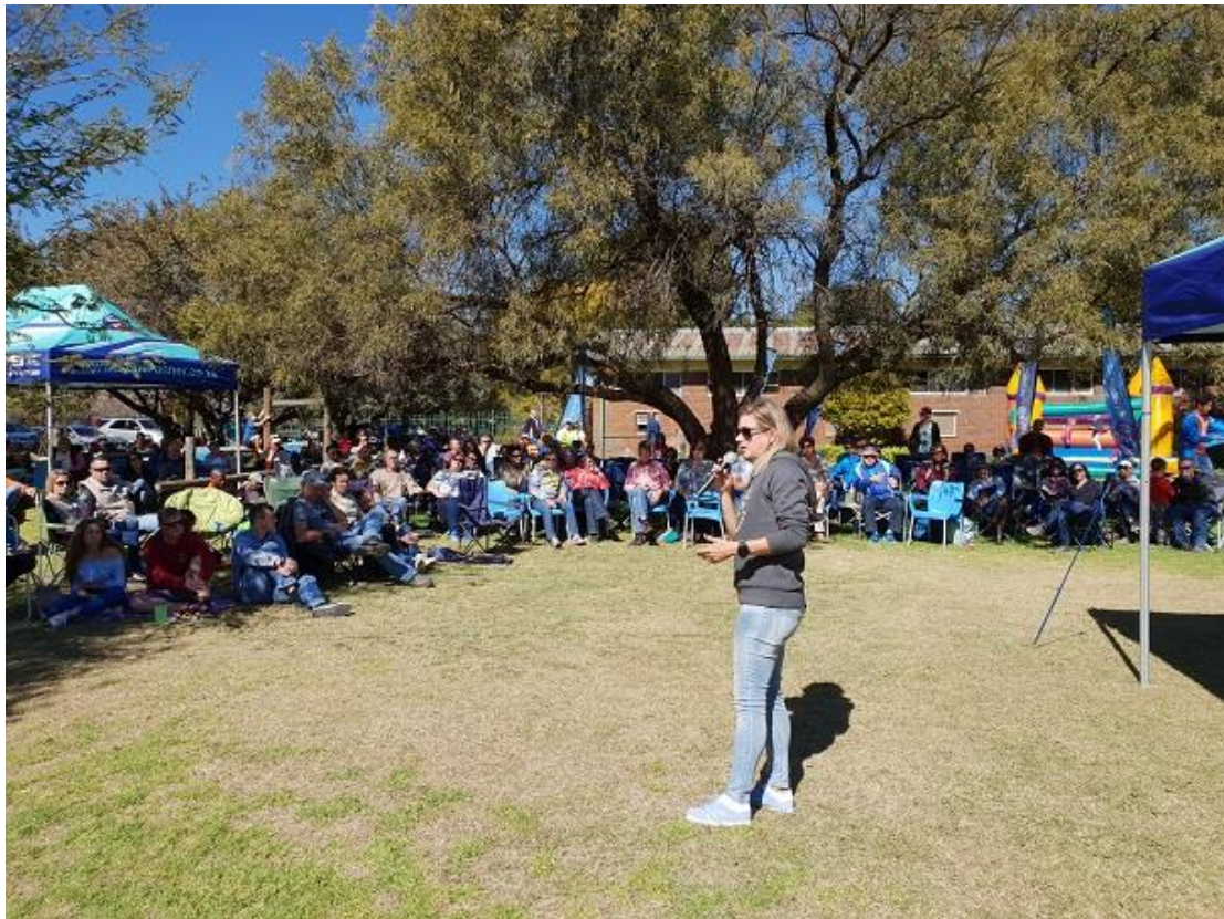
The attendance was excellent!