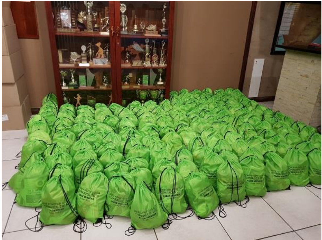
Our 2018 Comrades goodie bags