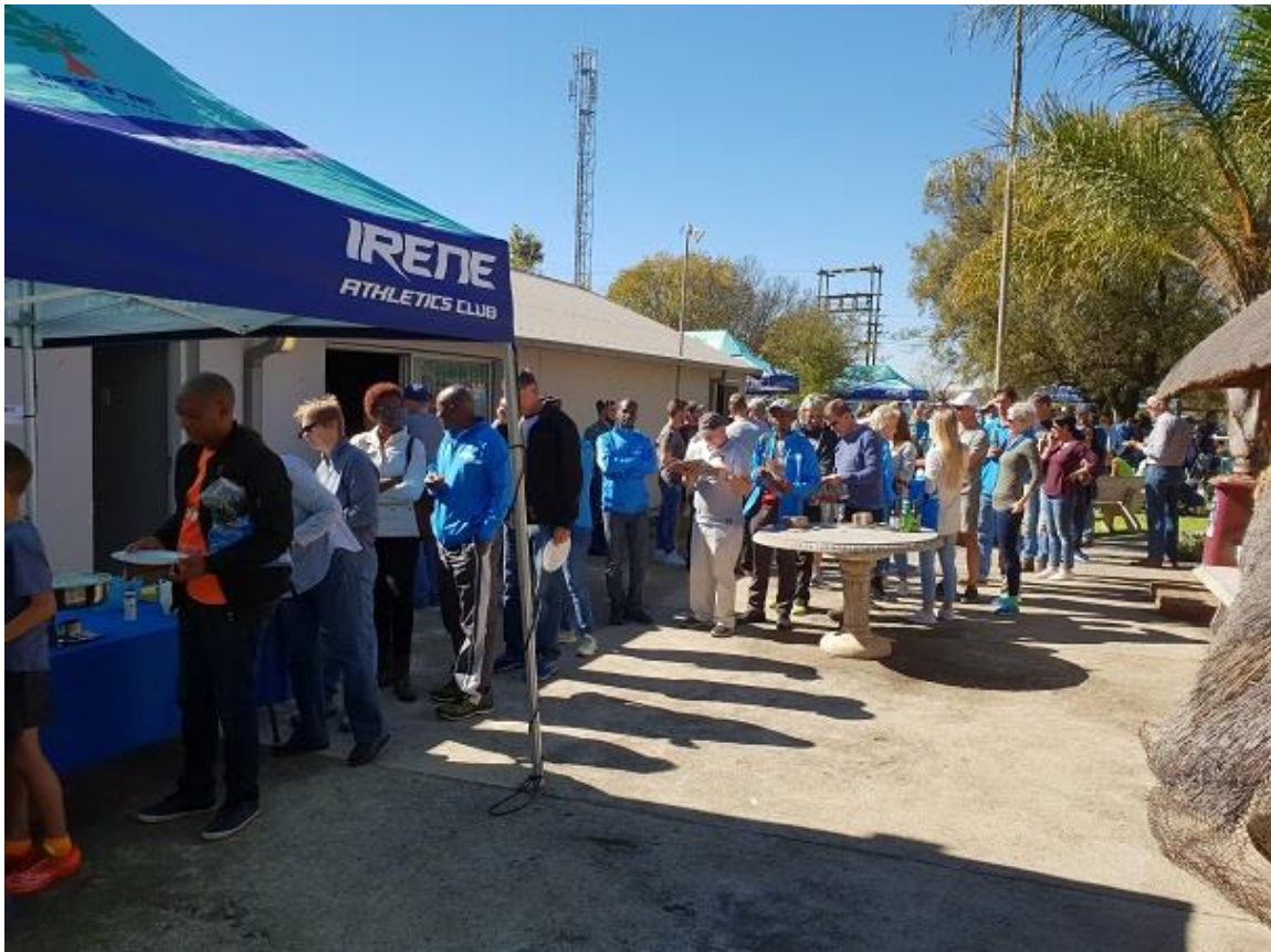
Lining up for an excellent plate of food