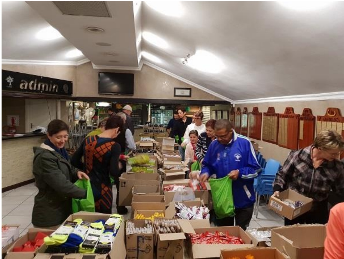
The team ins action