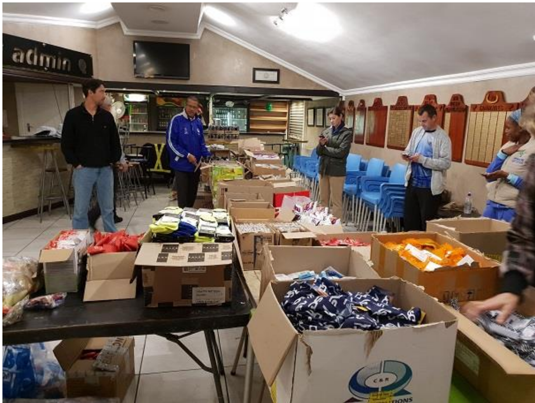
The goodie bags items ready for packing