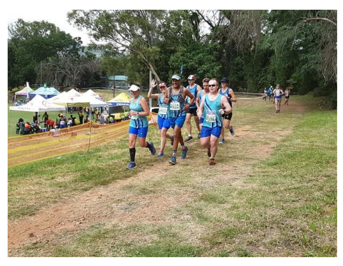
The Captain's bus arriving on time