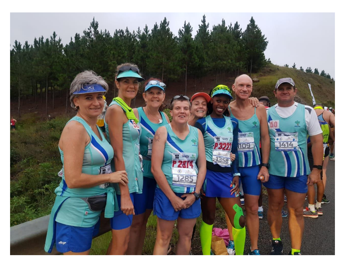
We were well represented at the Uniwisp race in Nelspruit