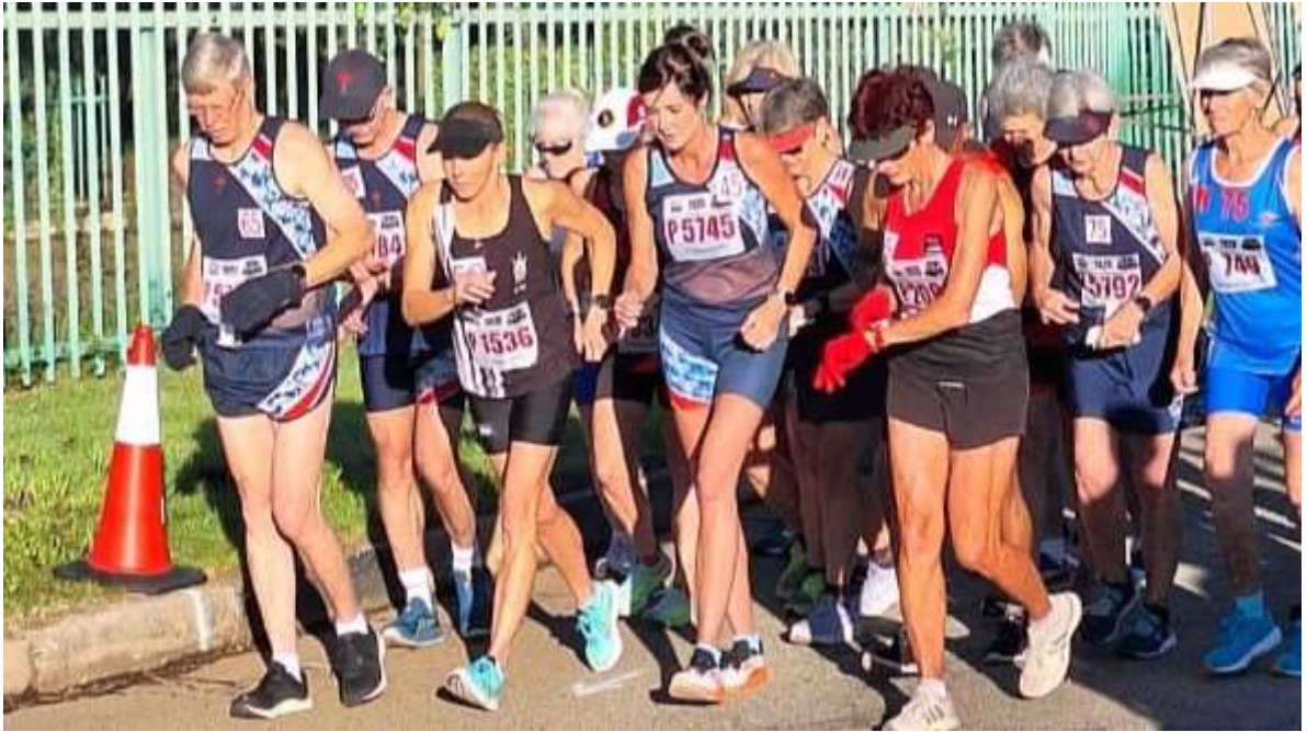
The start of the SA Masters Walkers championships