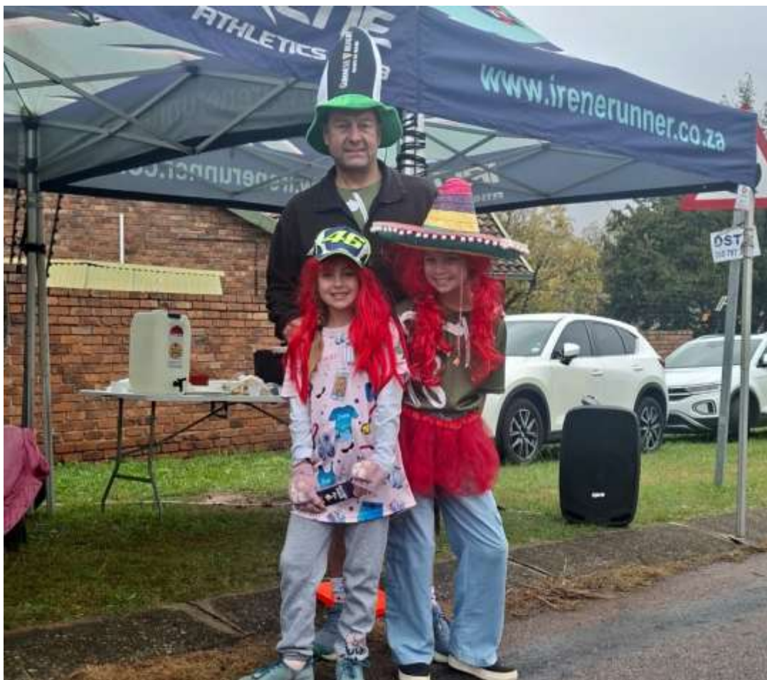
Hat winners at the support station