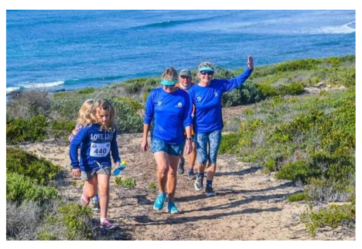
It looks like a family gathering on the trail route