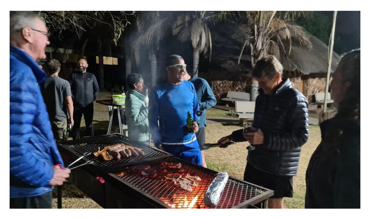
Nothing like a braai at the club house