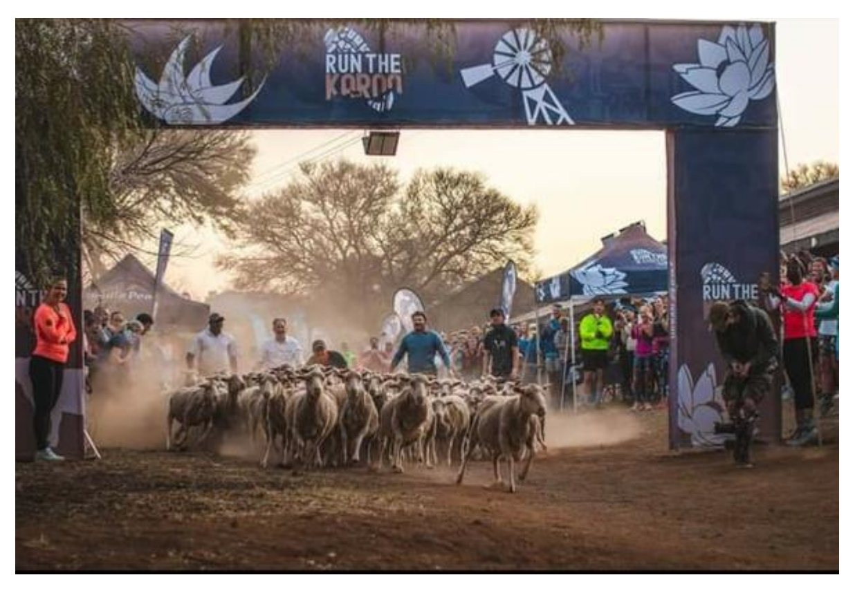
The start of the Sheep Run in the Karoo