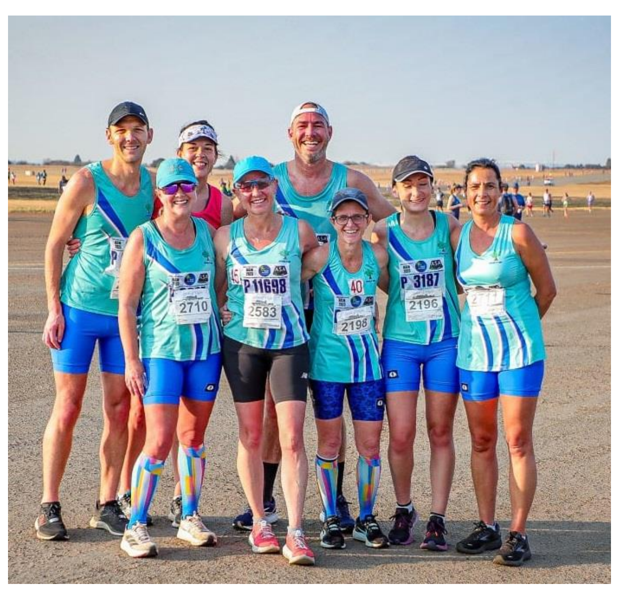
All smiles at the Spirit of Flight