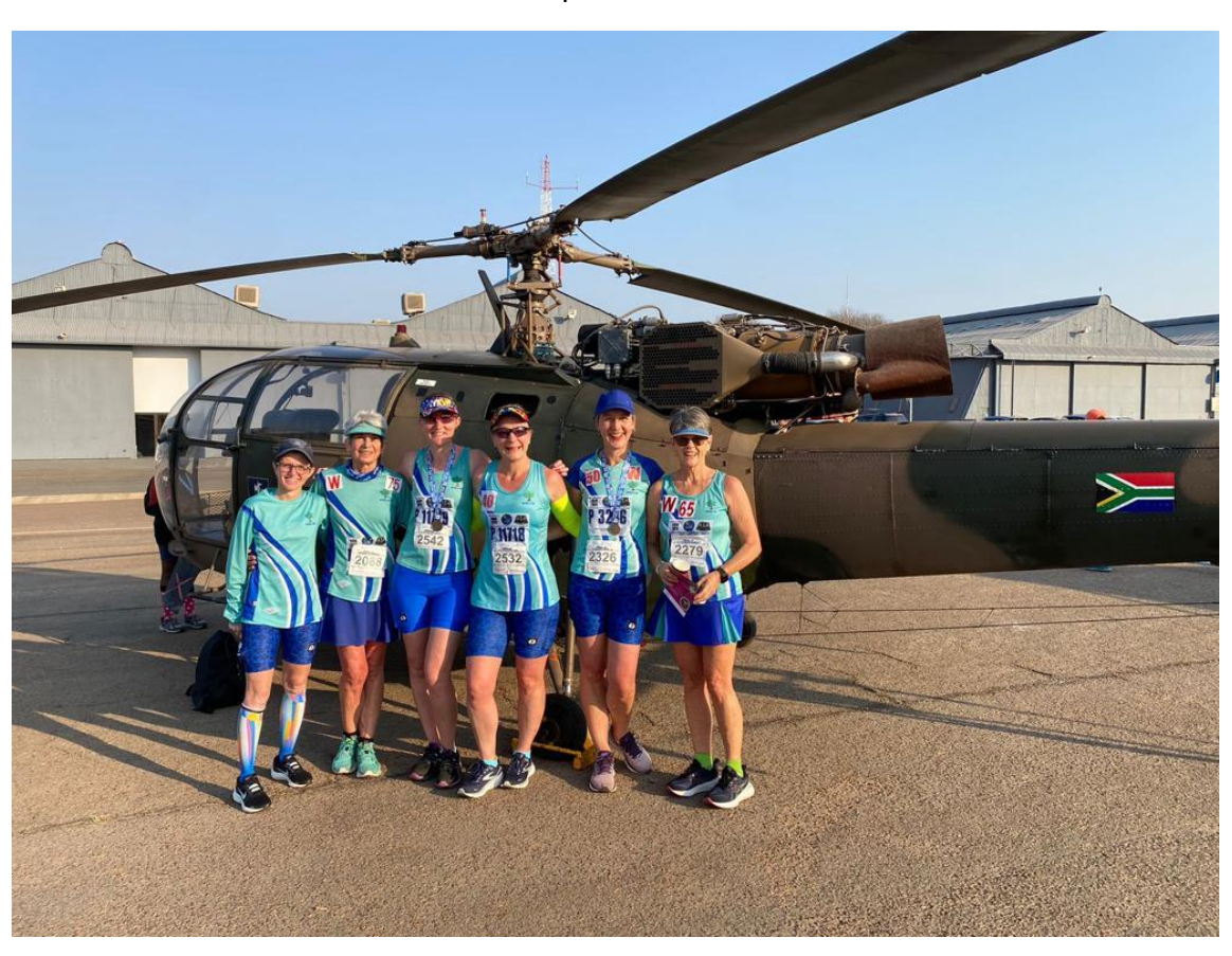
Very special to take photos at this race