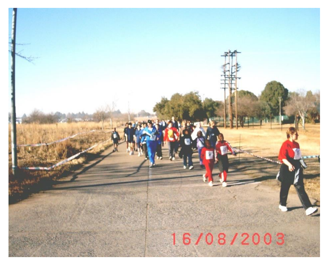
Walkers of the Irene Country Walk walking past the club house