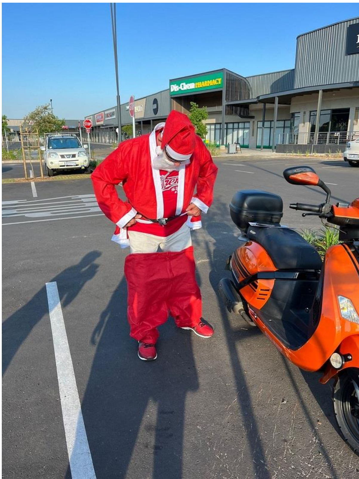
Santa caught with his pants on his knees at the Charity run on Sunday