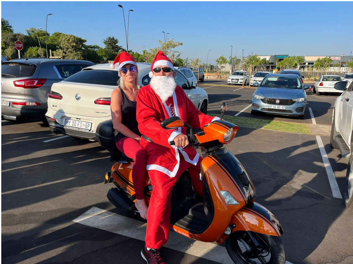
Santa and his navigator on the lead bike