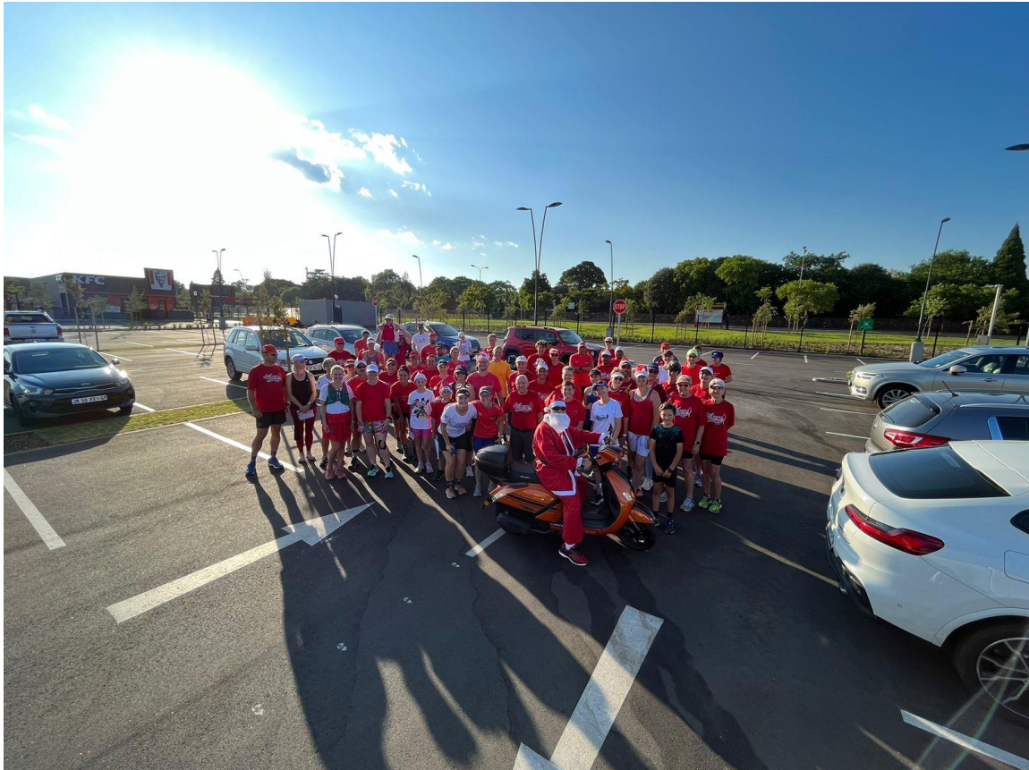
More than 60 people took part in the Charity run