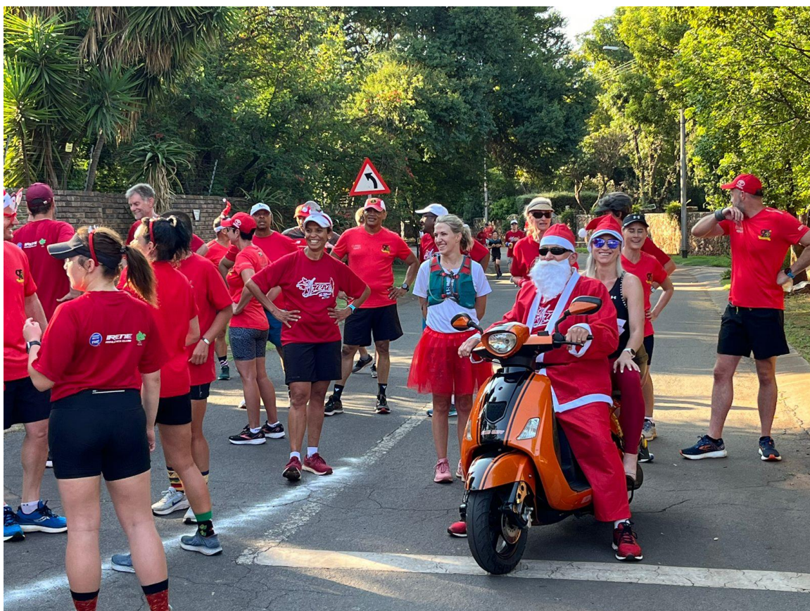
Taking a break to catch up with the slower runners