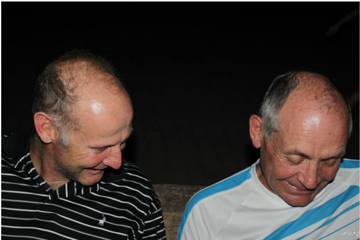
Bold is beautiful (ha-ha)