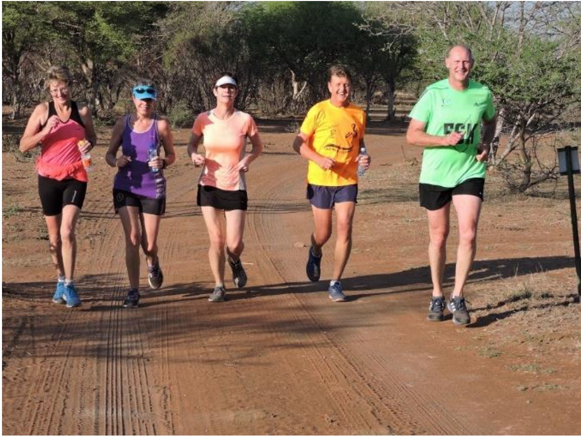
A few took the opportunity to do an early morning run