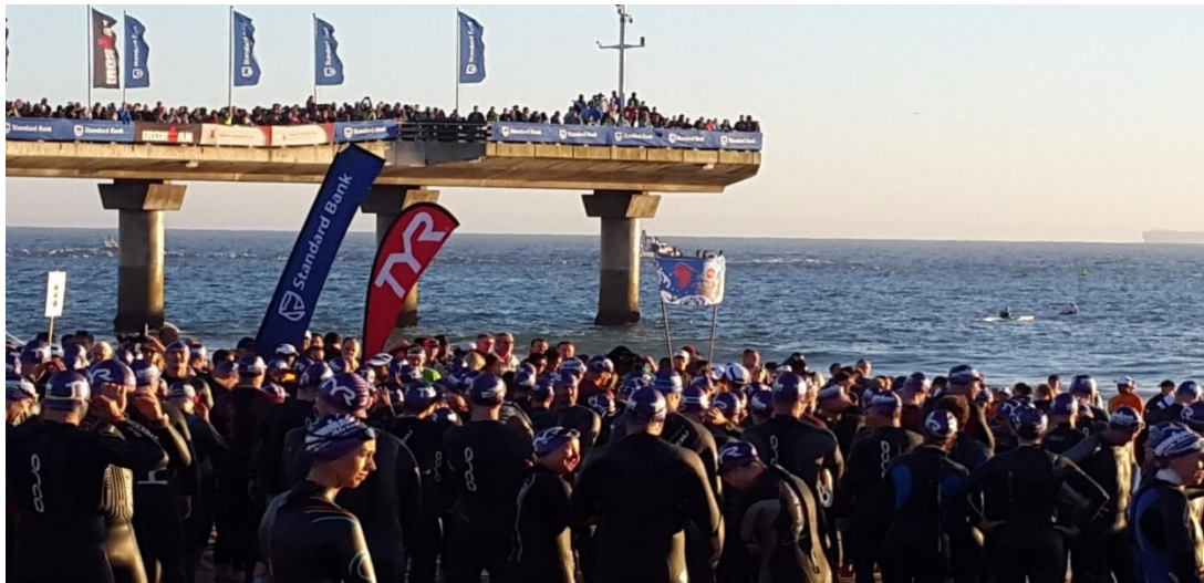
The start of the Iron Man