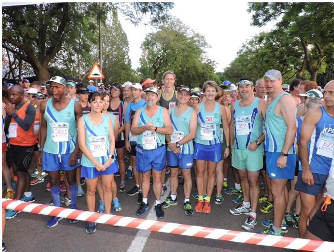
Eager Irene members at the start of the 21 km