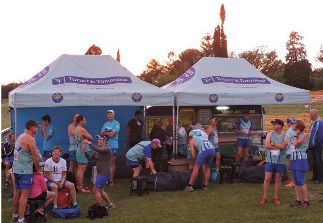
A lovely morning with perfect running conditions