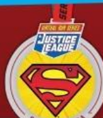
COLLECTOR'S EDITION MEDAL

AWESOME ENTRY PACK DIFFERENT FOR EACH RUN