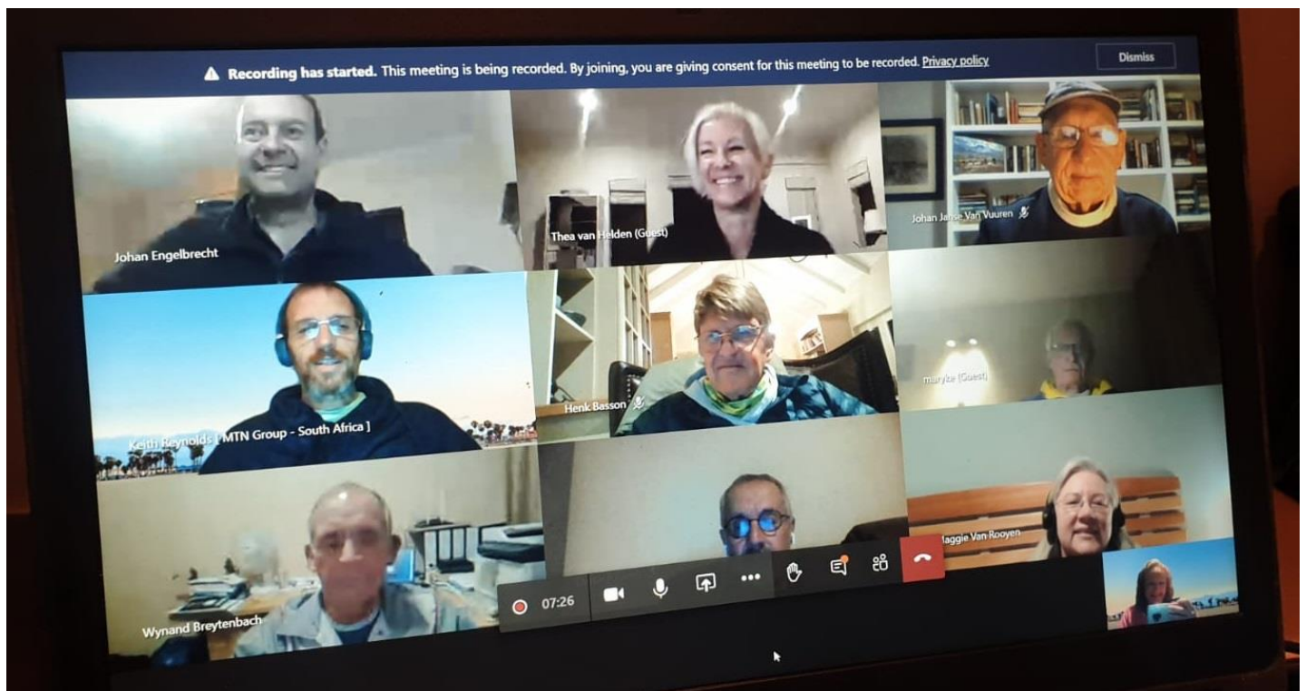
The management committee held their first virtual meeting on Tuesday evening