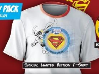
SPECIAL LIMITED EDITION T-SHIRT