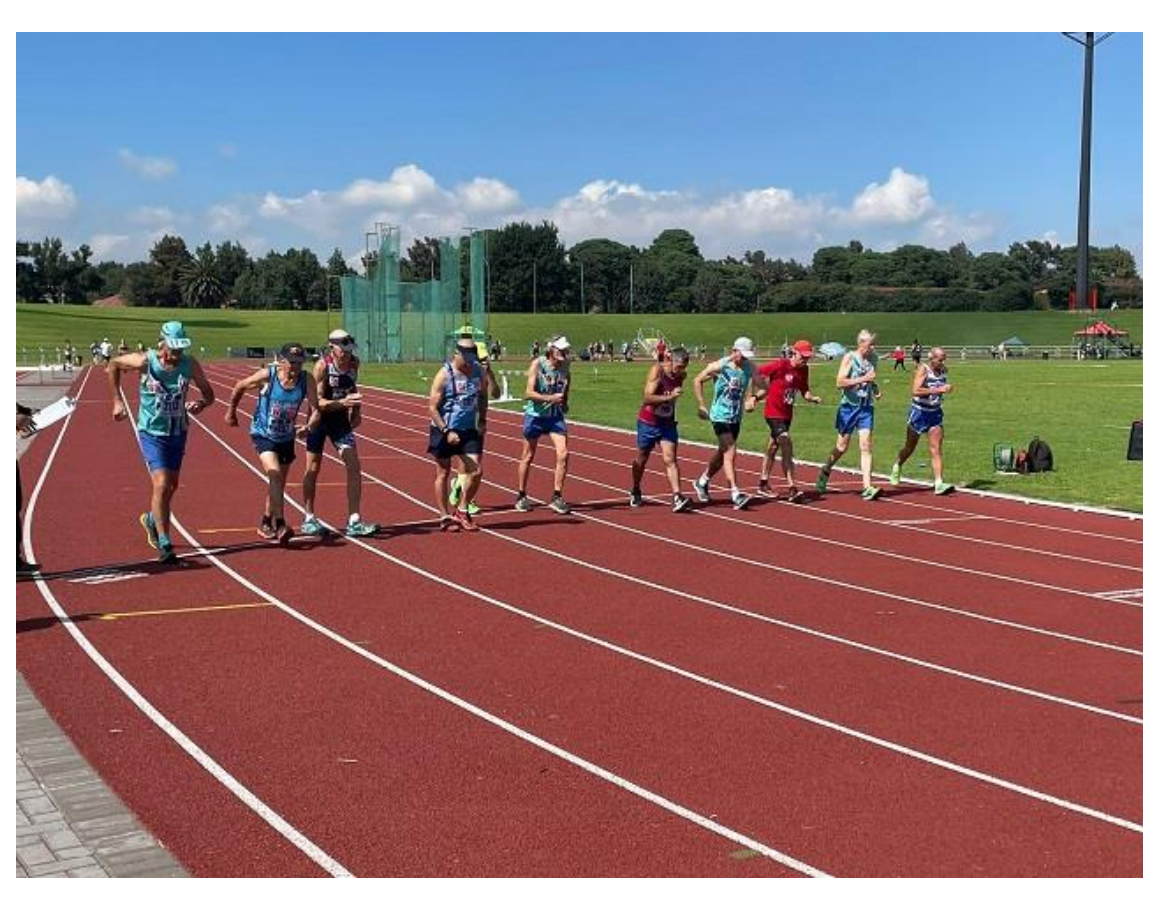
The start of the men