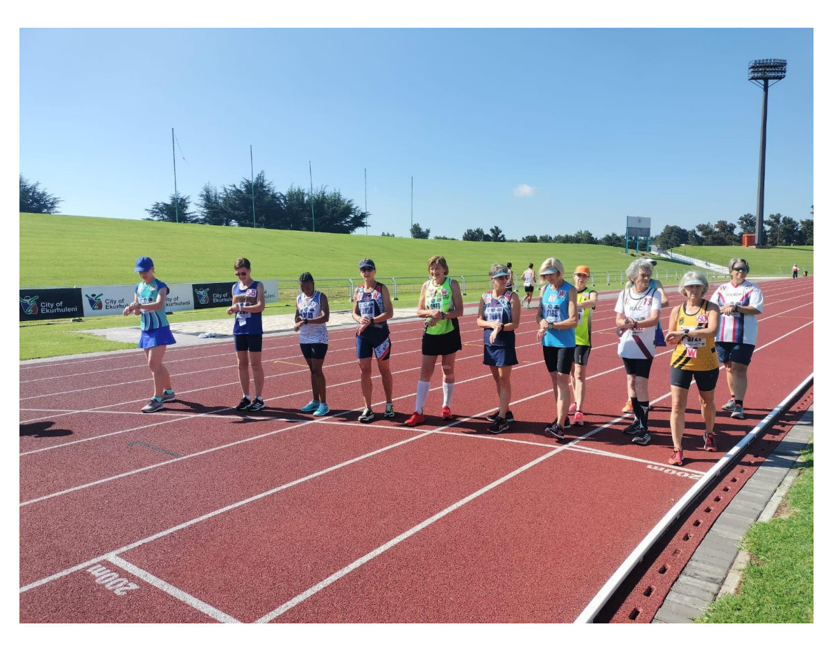
The start of the female walkers in Germiston