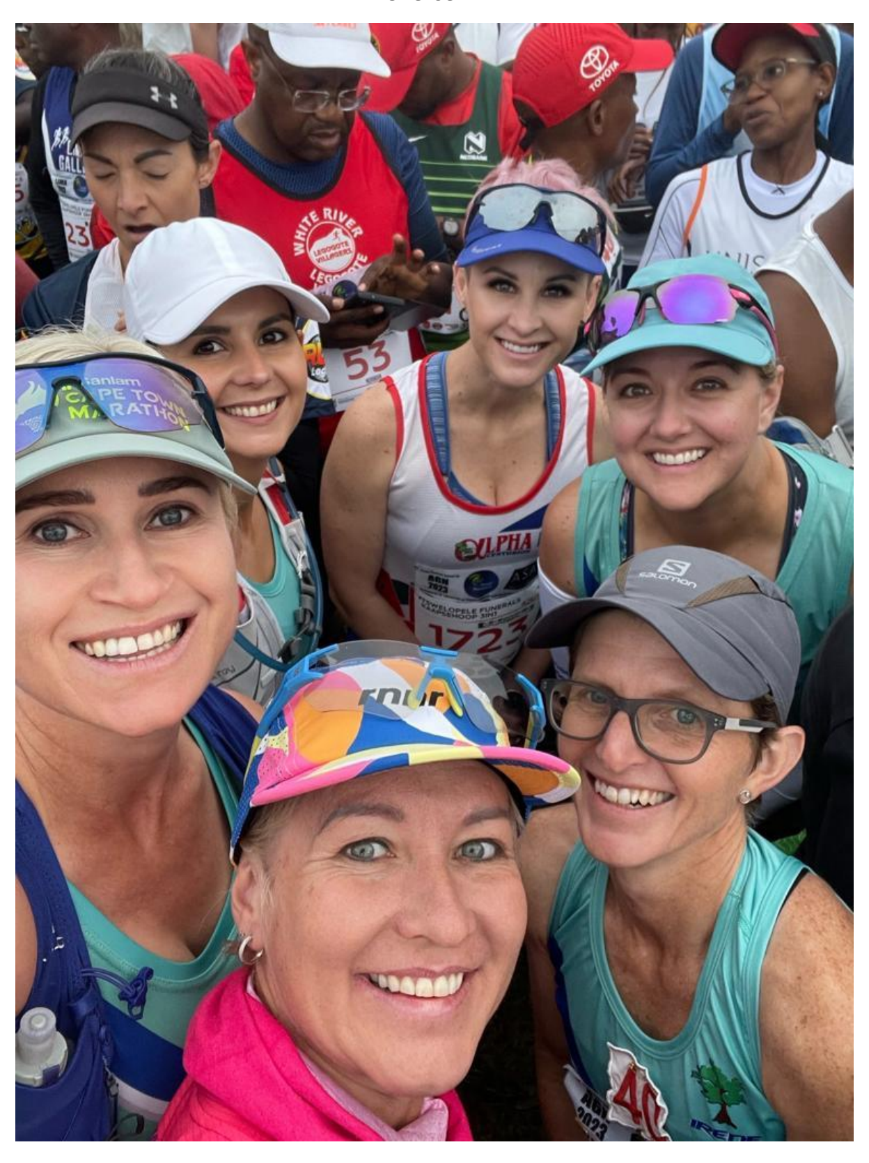
At the start of the Kaapsehoop Marathon