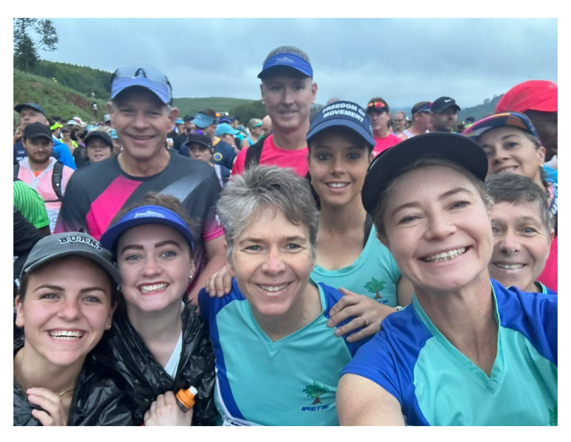
At the start of the 21 km