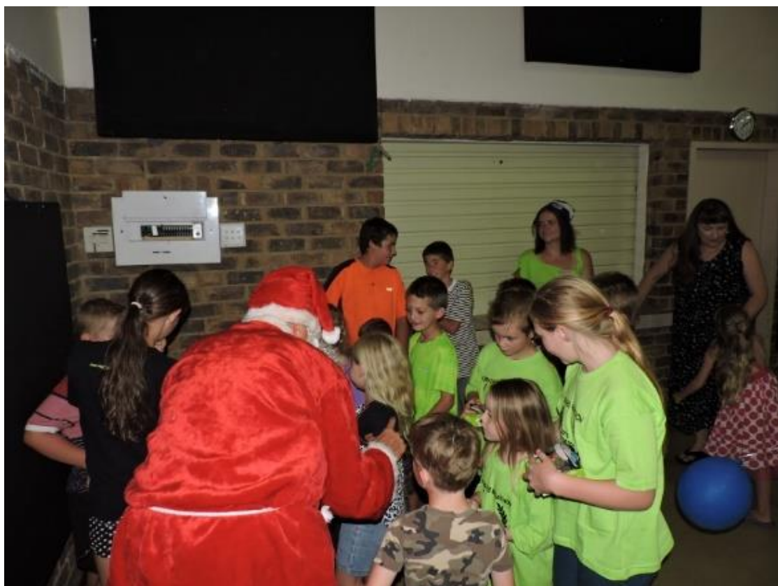
Excitement for the children