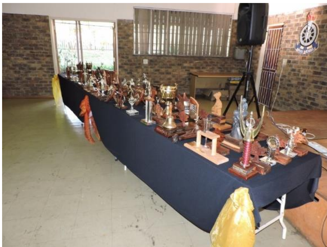
The trophy table