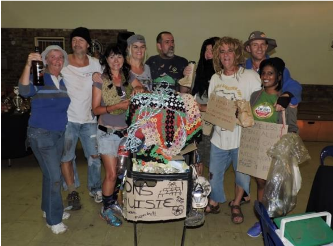
Happy Irene members