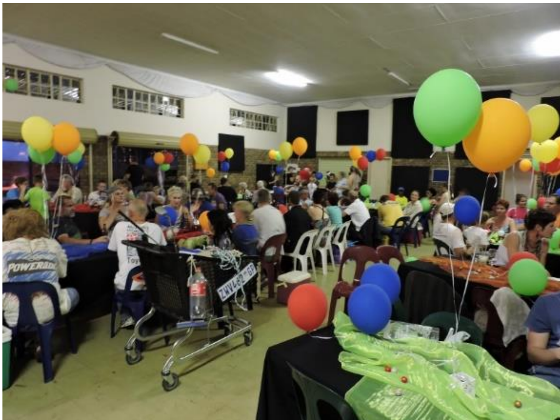
The venue was packed