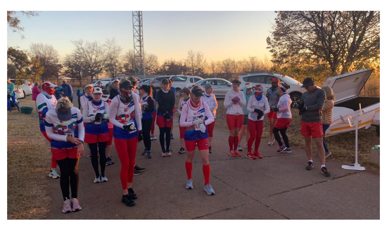
The start of the Alpha Centurion ladies at the Alpha Centurion 21 km championships held at our premises on Sunday