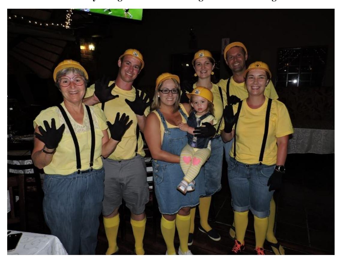
The following photos were taken at the dress-up party on Saturday night. Some people were hardly recognisable. It was a night of fun and laughter