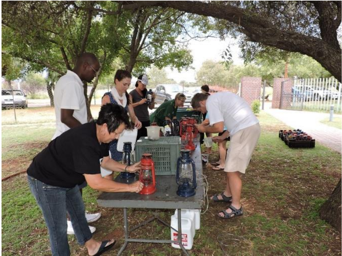
It was hard work to fill the lanterns on Sunday afternoon