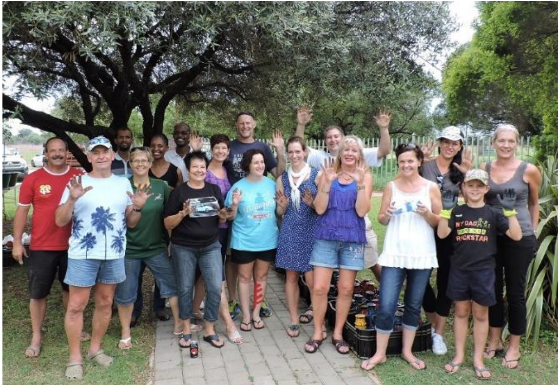
A great team who did an excellent job to fill the lanterns