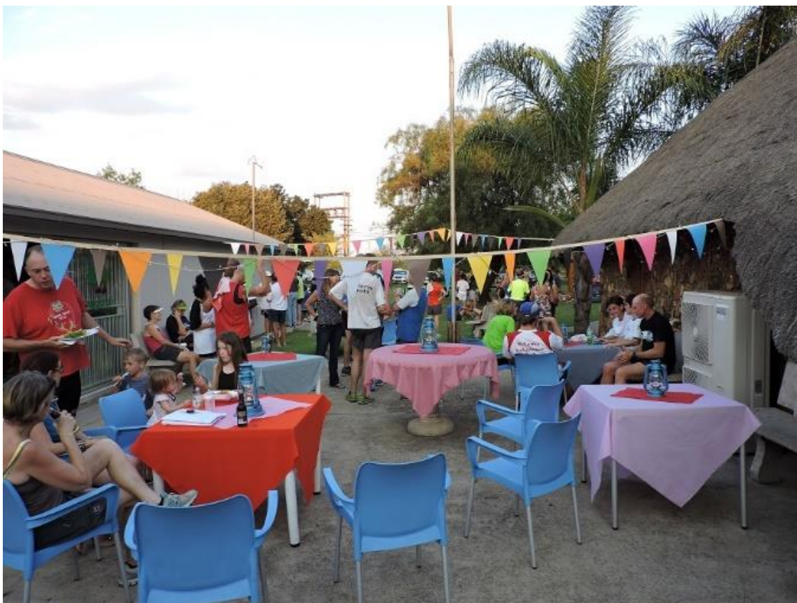
The social evening turned out beautiful in all aspects