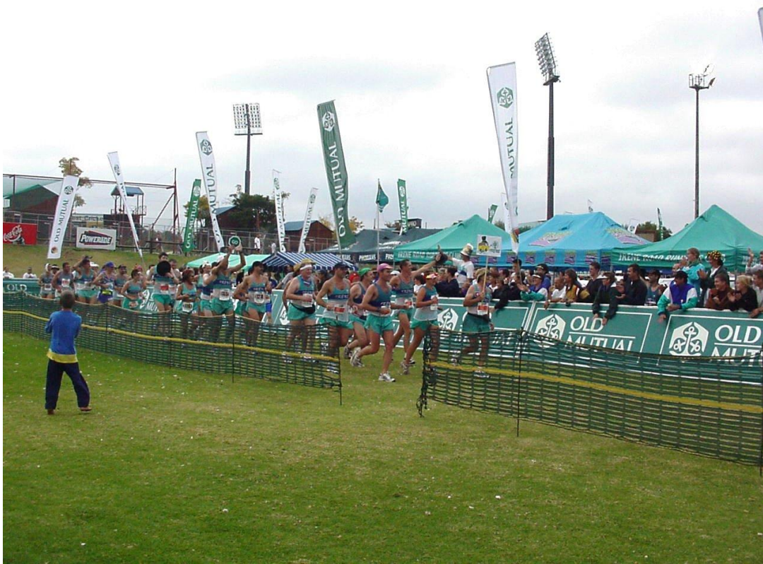
The Irene bus finishing our "Hat race" at the Wally