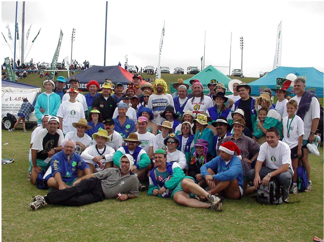
The "Hat race" runners. At least 3 of these members have passed away