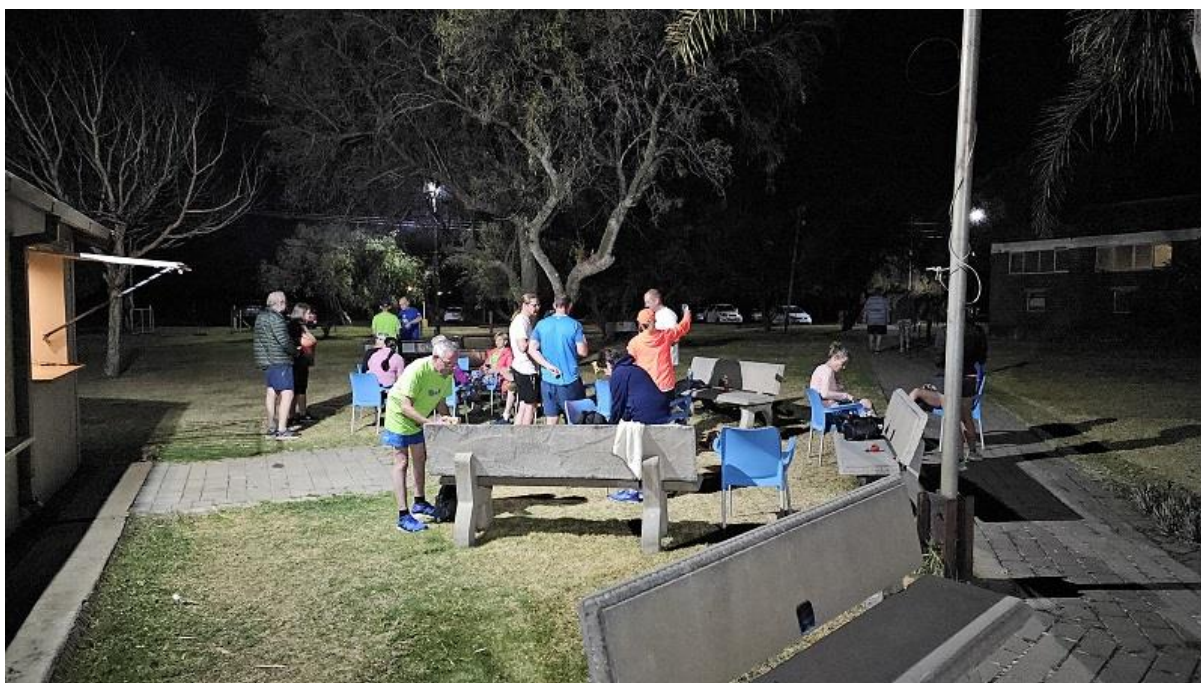
The weather now is perfect for a lovely evening every Tuesday evening