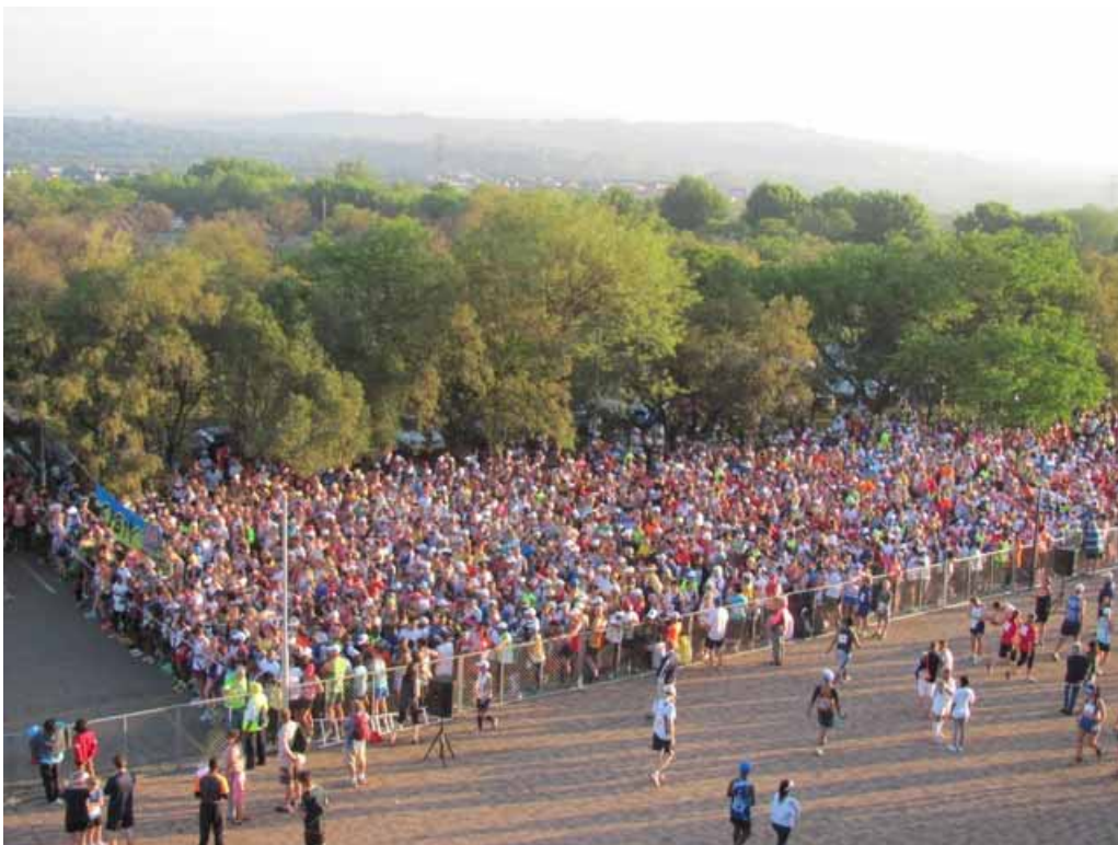
Thousands of athletes lining up at the start of the 2013 Liquifruit race

Unit 21, Miracle Retail Park Cnr. Lenchen & Old Johannesburg Rd P O Box 8575 Centurion 0046 email : centurionm@coastalhire.co.za