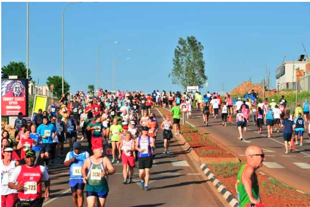
The turnaround point at Southdowns shopping centre