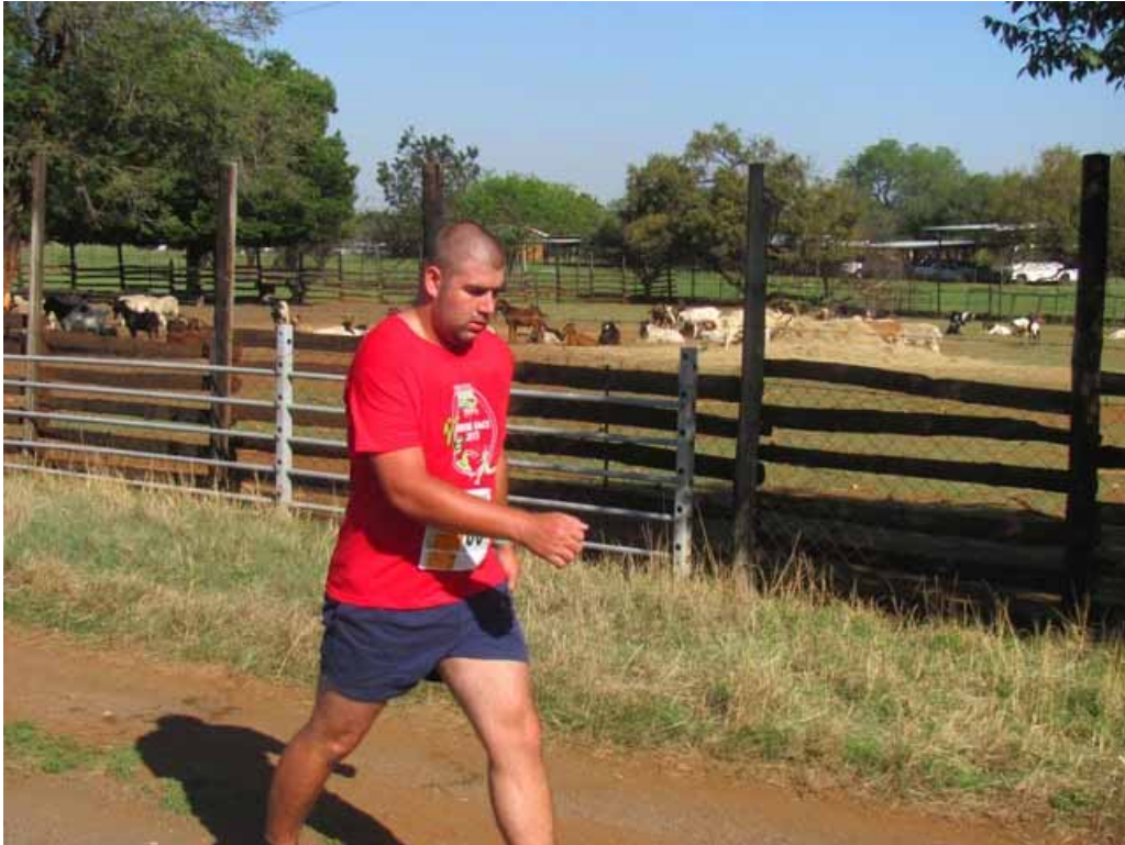
What a privilege to have farm animals as spectators