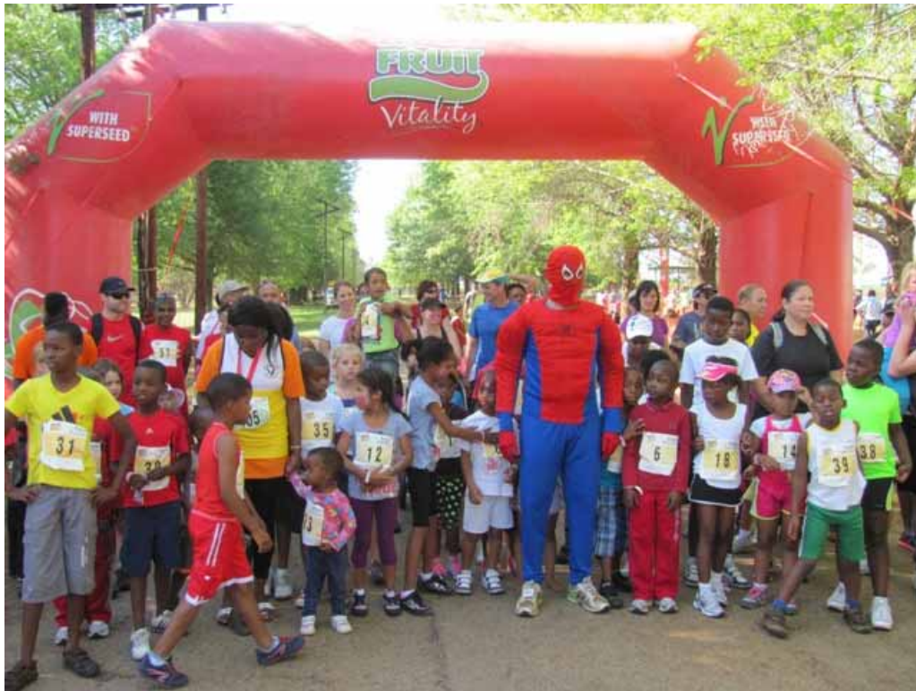
Spiderman getting ready to run the kiddies 1 km dash. He injured his hamstring in the process to keep up with the kids