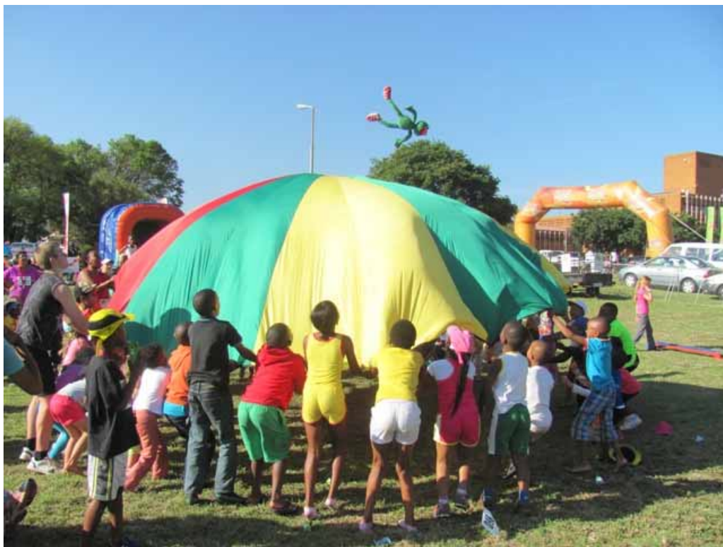
Action at the kiddies corner where parents could leave their youngsters to enjoy the race without worrying about them