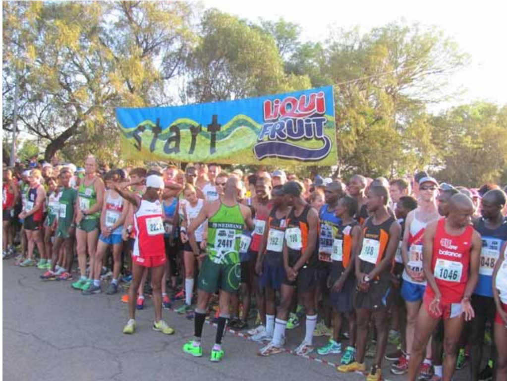
Some of the top athletes in the country took part