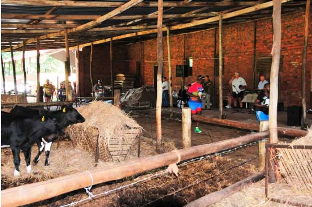
Runners running through the barn at the dairy farm with cattle as spectators and a “boereorkes” performing