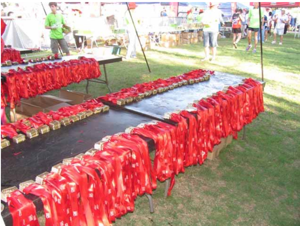
Thousand of medals ready to be handed out