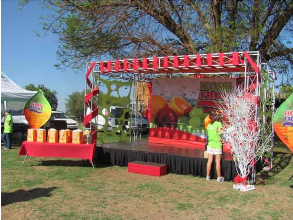
You won't find a stage like this other than at Irene races